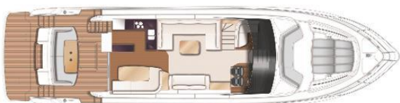
Princess 68 Upper Deck Layout Plan