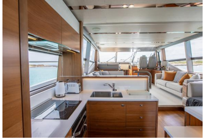
Princess 68 For Sale - Yachtquarters