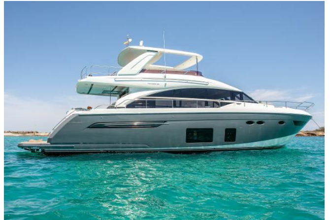
Princess 68 For Sale - Yachtquarters