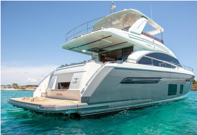
Princess 68 For Sale - Yachtquarters