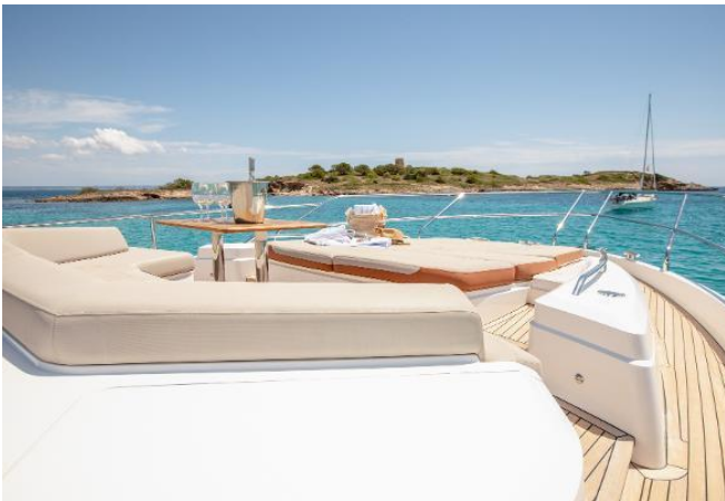
Princess 68 For Sale - Yachtquarters