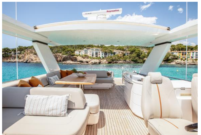
Princess 68 For Sale - Yachtquarters