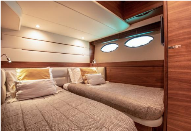
Princess 68 For Sale - Yachtquarters