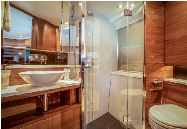
Princess 68 For Sale - Yachtquarters