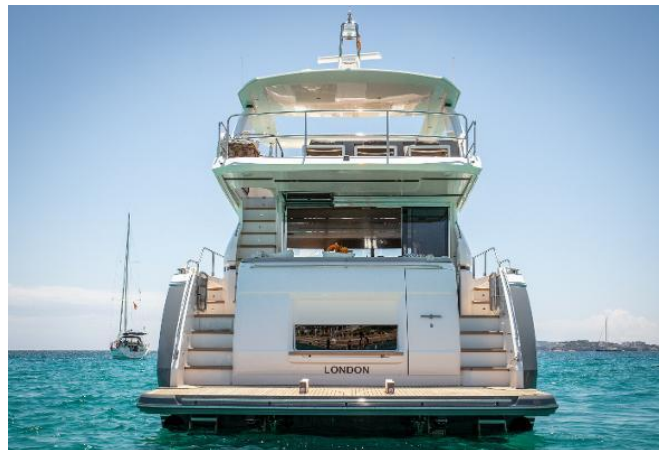
Princess 68 For Sale - Yachtquarters