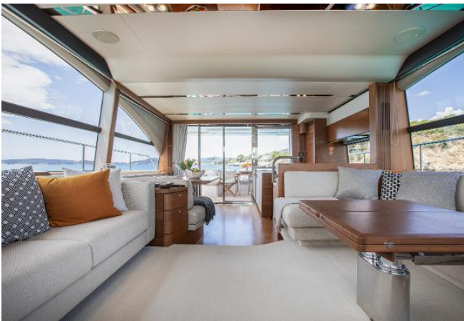
Princess 68 For Sale - Yachtquarters