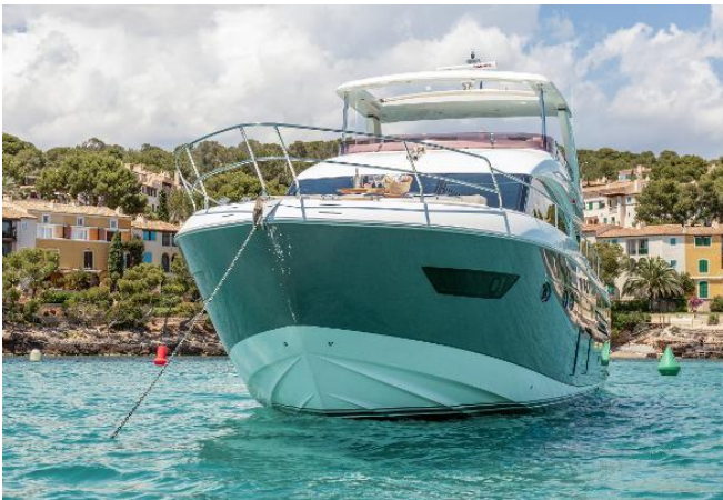
Princess 68 For Sale - Yachtquarters