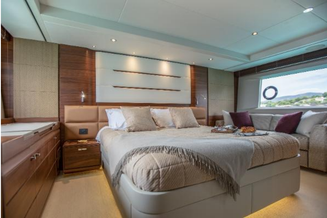
Princess 68 For Sale - Yachtquarters