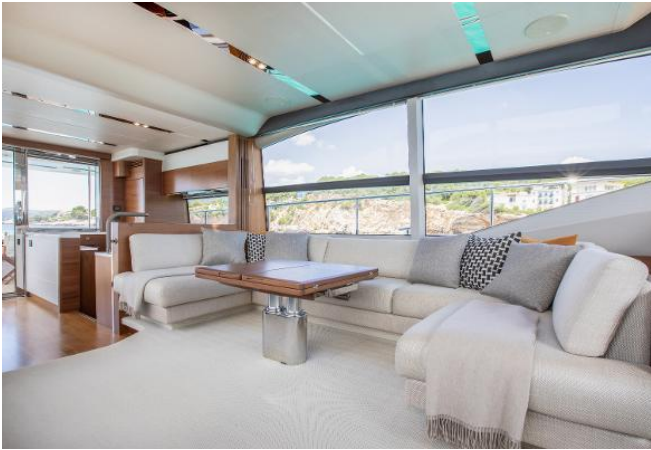
Princess 68 For Sale - Yachtquarters