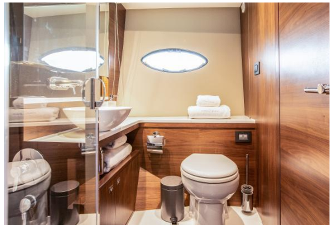
Princess 68 For Sale - Yachtquarters