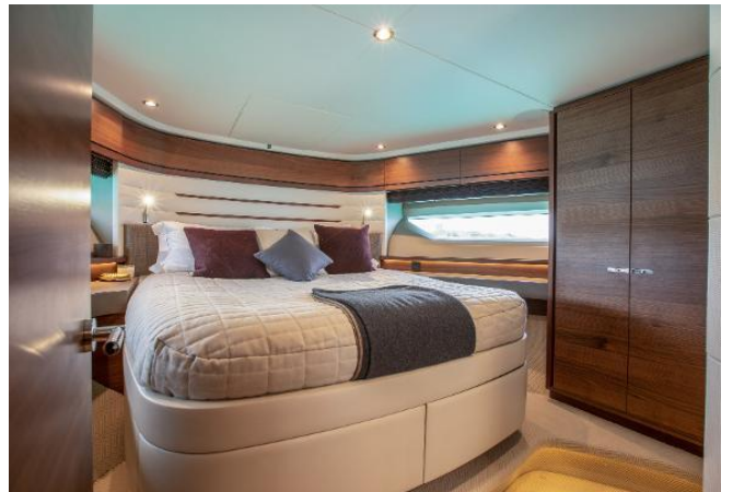
Princess 68 For Sale - Yachtquarters