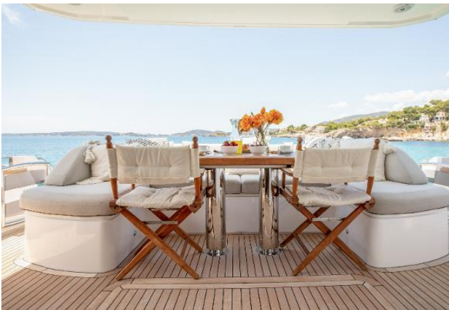
Princess 68 For Sale - Yachtquarters