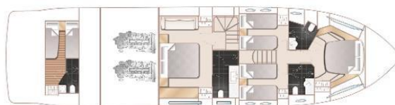
Princess 68 Lower Deck Layout Plan