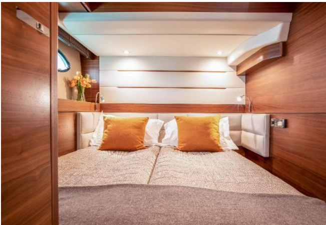
Princess 68 For Sale - Yachtquarters