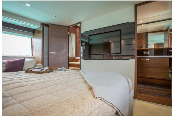
Princess 68 For Sale - Yachtquarters