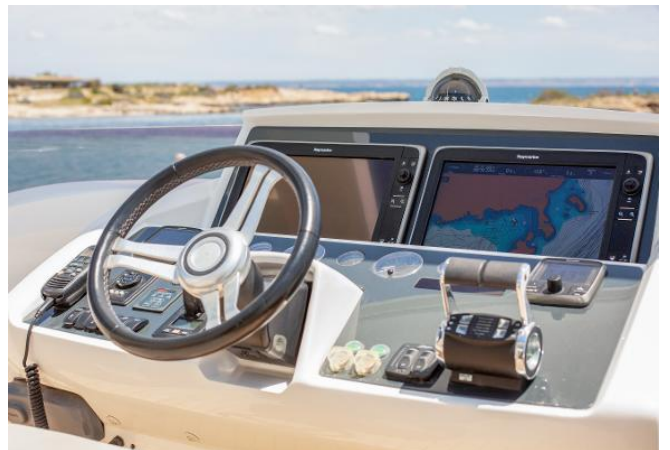
Princess 68 For Sale - Yachtquarters