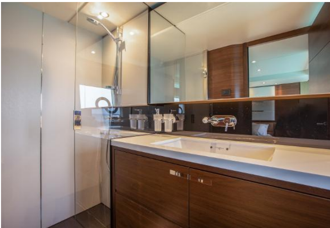
Princess 68 For Sale - Yachtquarters