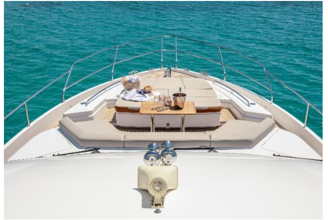
Princess 68 For Sale - Yachtquarters