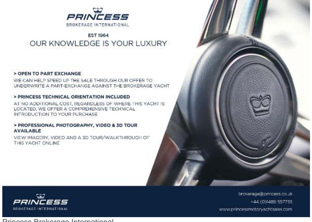
Princess Brokerage International