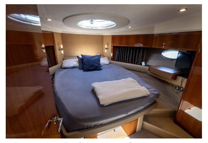
Princess V53 For Sale - Master Cabin