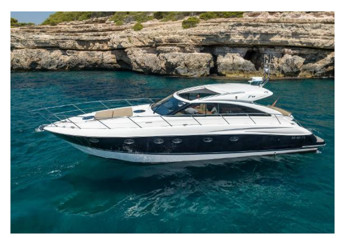
Princess V53 For Sale