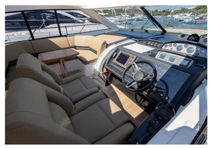
Princess V53 For Sale - Helm