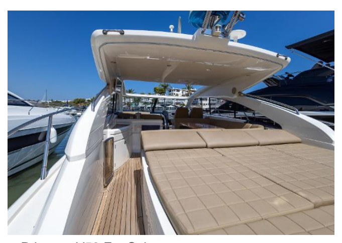
Princess V53 For Sale