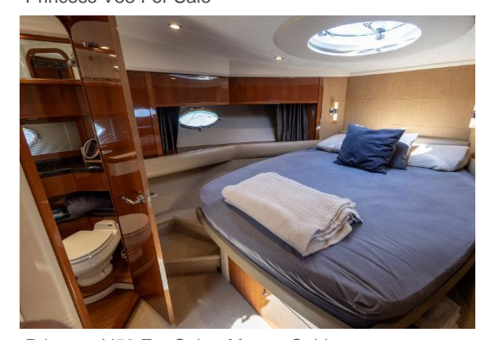
Princess V53 For Sale - Master Cabin