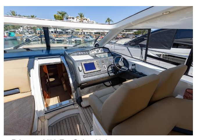
Princess V53 For Sale - Helm