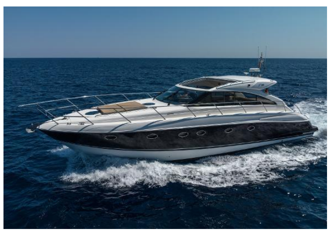
Princess V53 For Sale