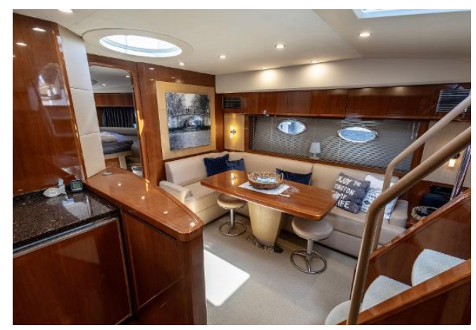
Princess V53 For Sale