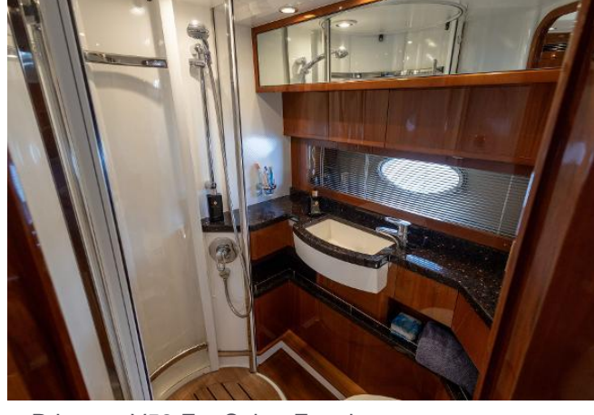
Princess V53 For Sale - Ensuite