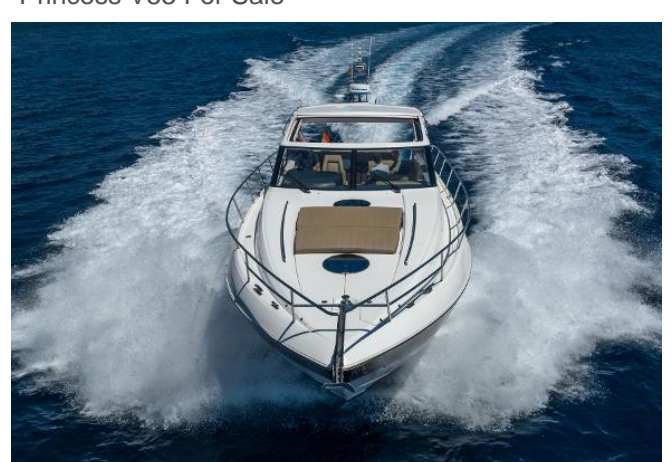
Princess V53 For Sale