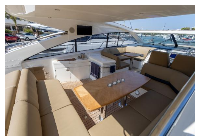
Princess V53 For Sale