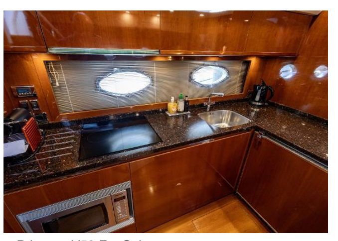
Princess V53 For Sale