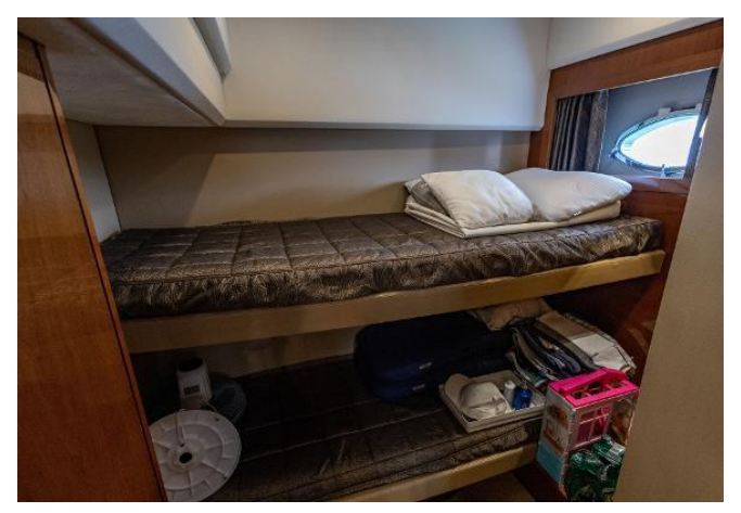
Princess V53 For Sale - Guest Cabin