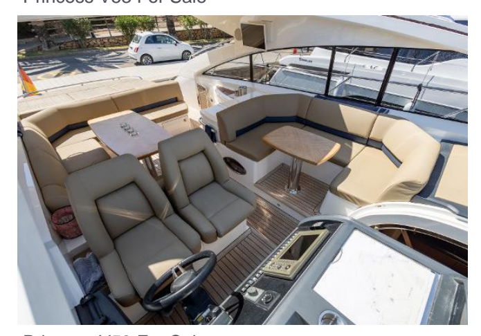
Princess V53 For Sale