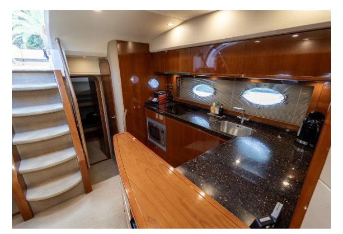
Princess V53 For Sale