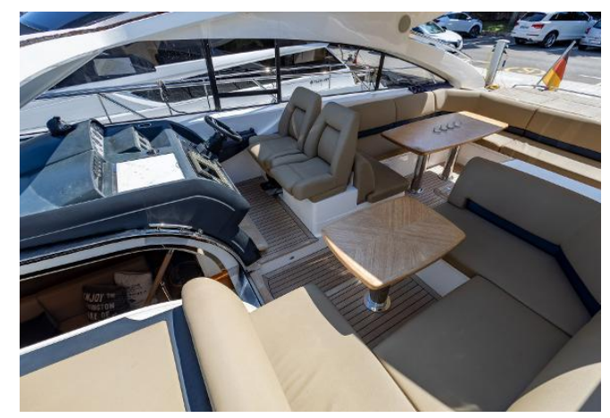
Princess V53 For Sale - Helm