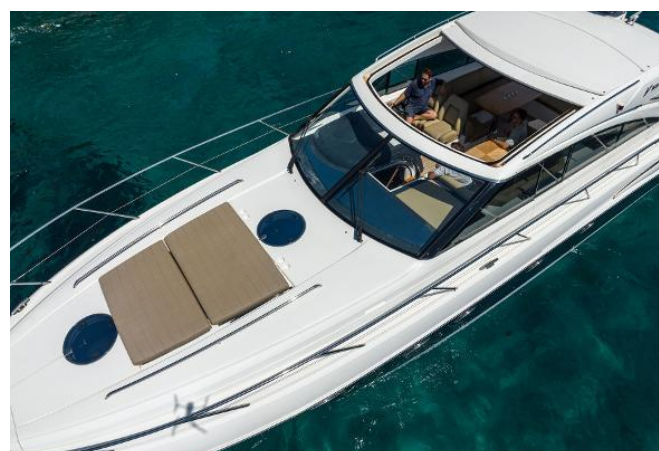
Princess V53 For Sale