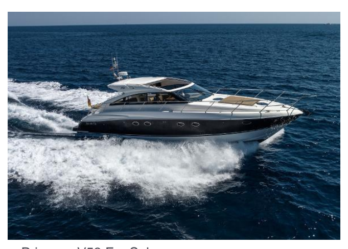
Princess V53 For Sale