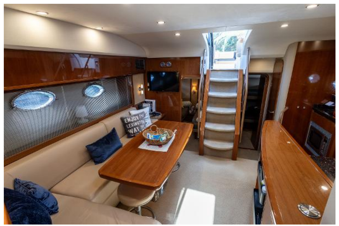
Princess V53 For Sale - Saloon