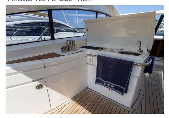
Princess V53 For Sale