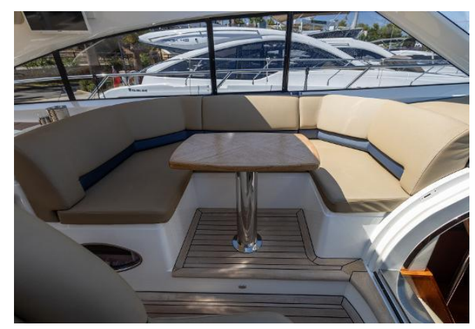
Princess V53 For Sale