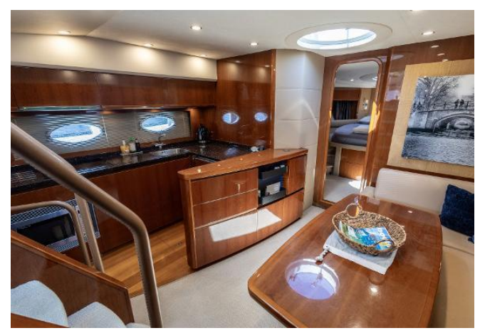
Princess V53 For Sale