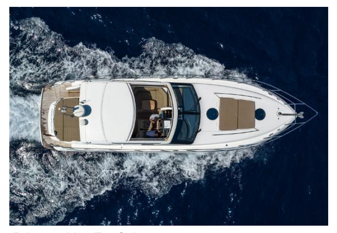
Princess V53 For Sale