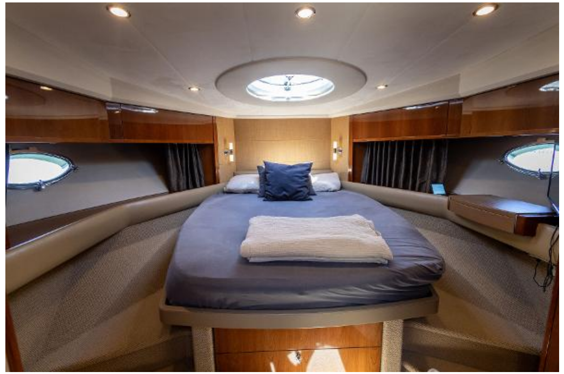
Princess V53 For Sale - Master Cabin

Email: balearicsbrokerage@princessmysales.com Tel: +34 971 676 439