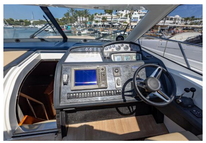
Princess V53 For Sale - Helm