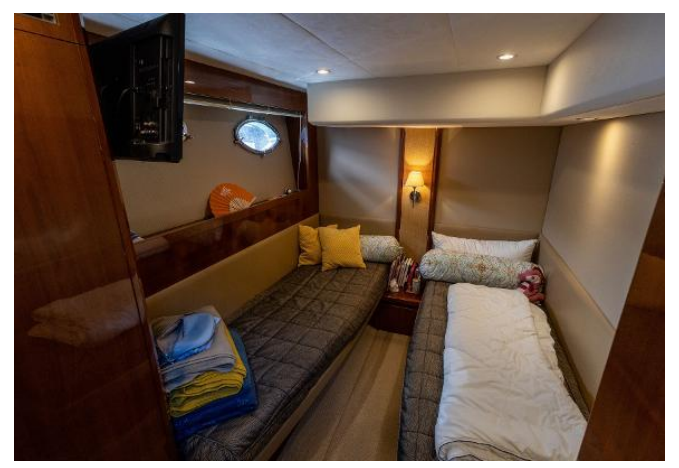
Princess V53 For Sale - Guest Cabin