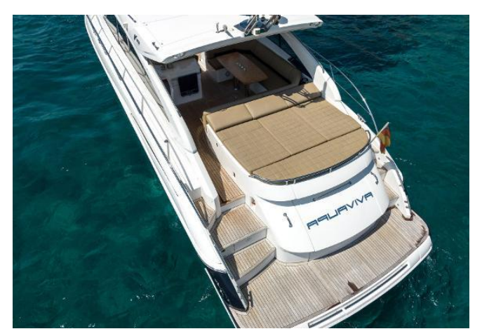
Princess V53 For Sale