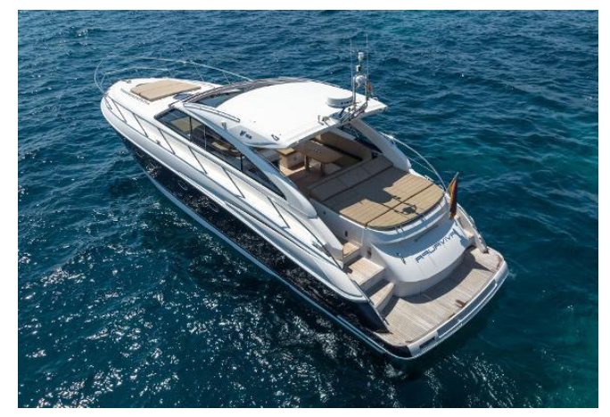
Princess V53 For Sale