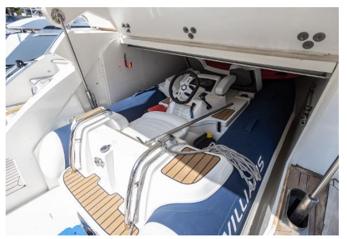
Princess V53 For Sale