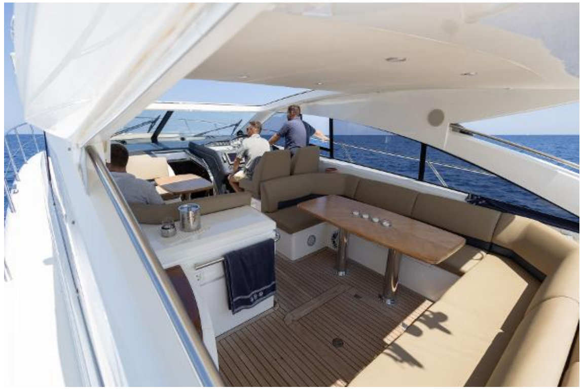
Princess V53 For Sale

Email: balearicsbrokerage@princessmysales.com Tel: +34 971 676 439