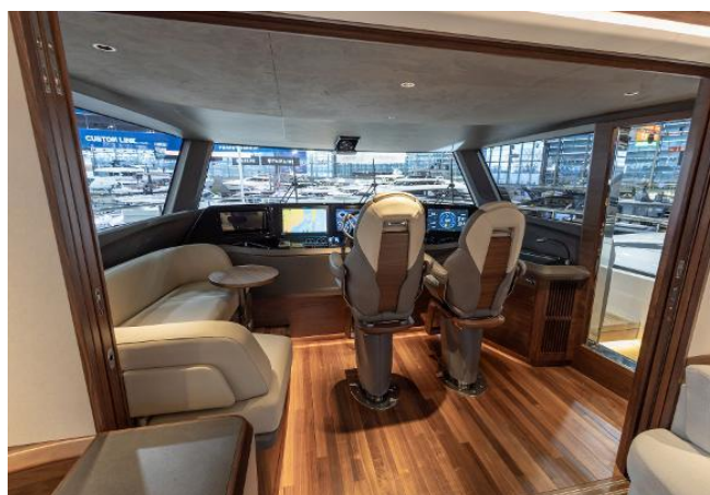
Princess X80031 For Sale