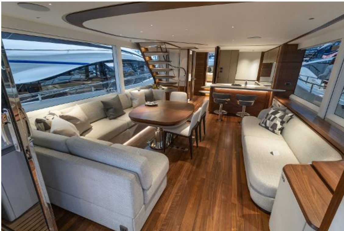
Princess X80031 For Sale