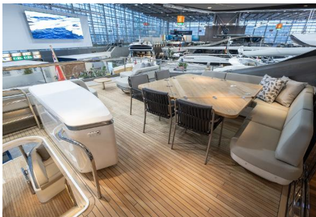
Princess X80031 For Sale