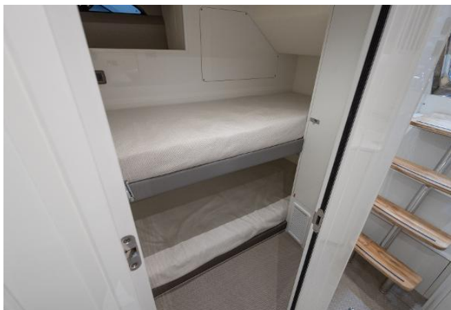
Princess X80031 For Sale