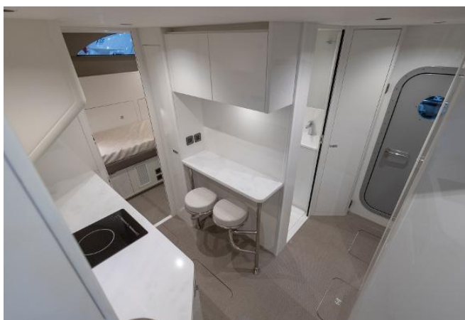
Princess X80031 For Sale