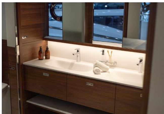
Princess X80031 For Sale