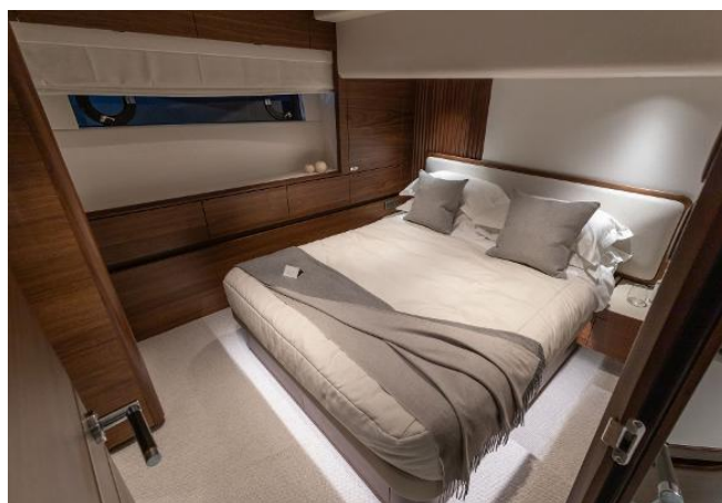
Princess X80031 For Sale