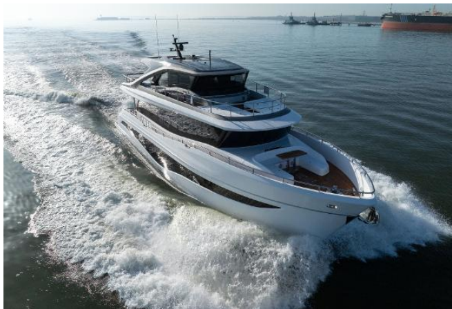
Princess X80031 For Sale