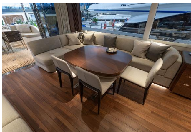
Princess X80031 For Sale