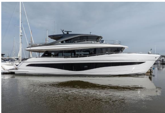
Princess X80031 For Sale