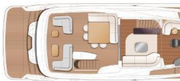
X80 Flybridge - standard