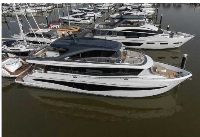
Princess X80031 For Sale