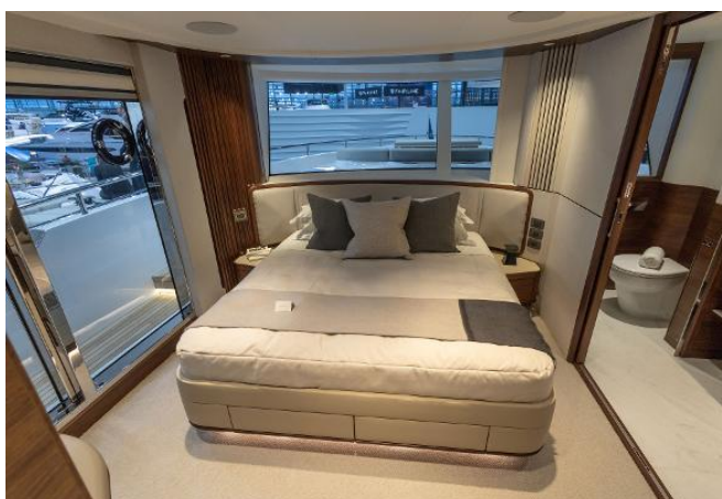
Princess X80031 For Sale