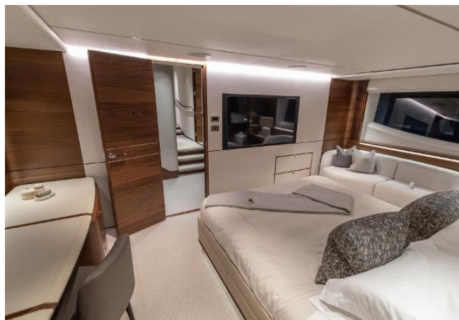
Princess X80031 For Sale