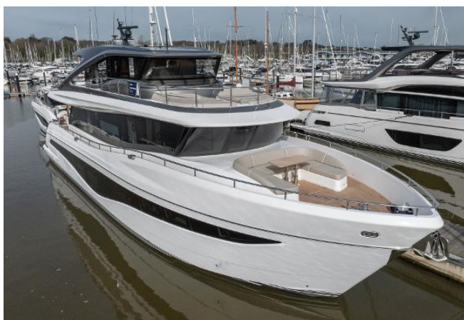
Princess X80031 For Sale