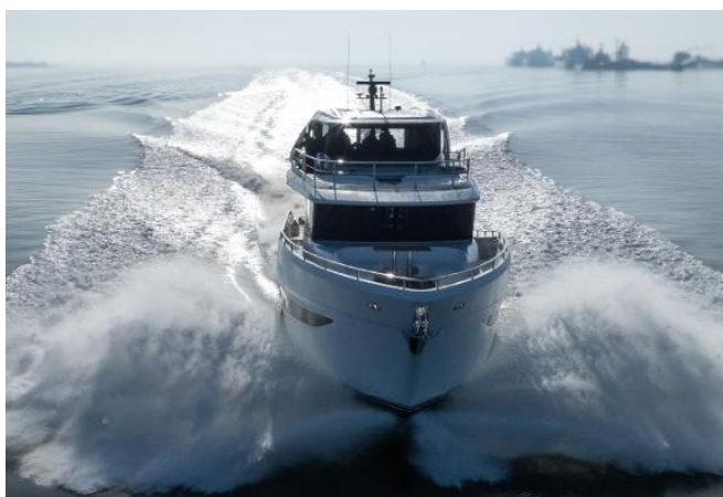
Princess X80031 For Sale