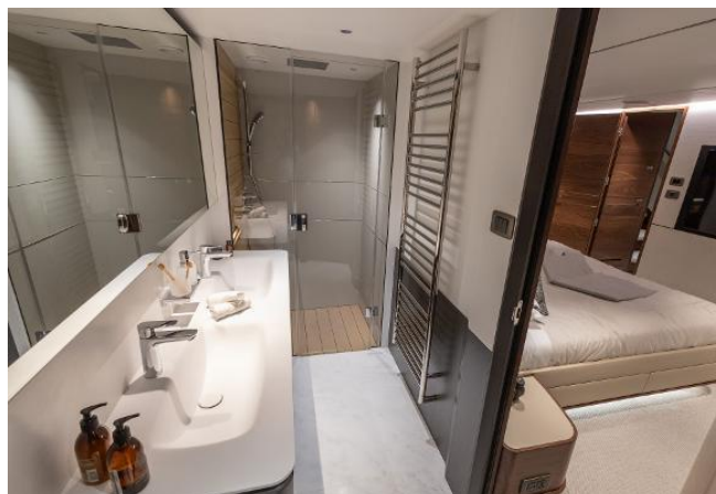
Princess X80031 For Sale