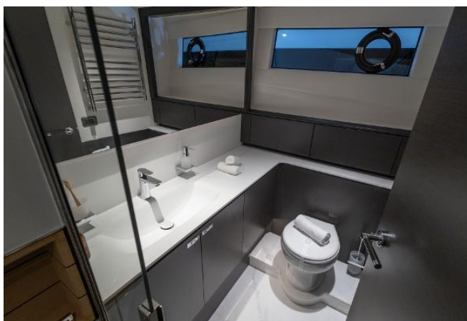
Princess X80031 For Sale