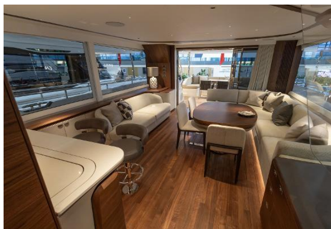
Princess X80031 For Sale