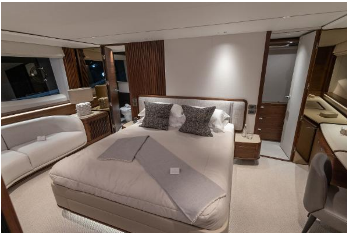
Princess X80031 For Sale