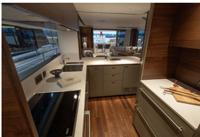
Princess X80031 For Sale