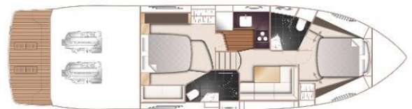
Manufacturer Provided Image: Princess V48 Upper Deck Layout Manufacturer Provided Image: Princess V48 Lower Deck Layout