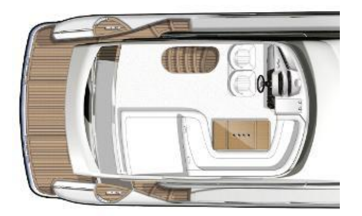
Manufacturer Provided Image: Princess Flybridge 42 Motor Yacht Flybridge Layout