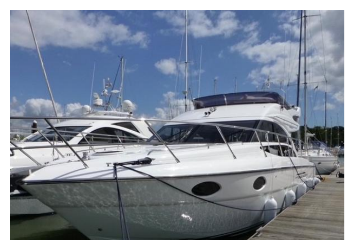
Princess 42 Flybridge for sale