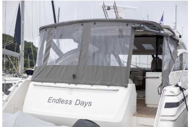
Princess V52 For Sale