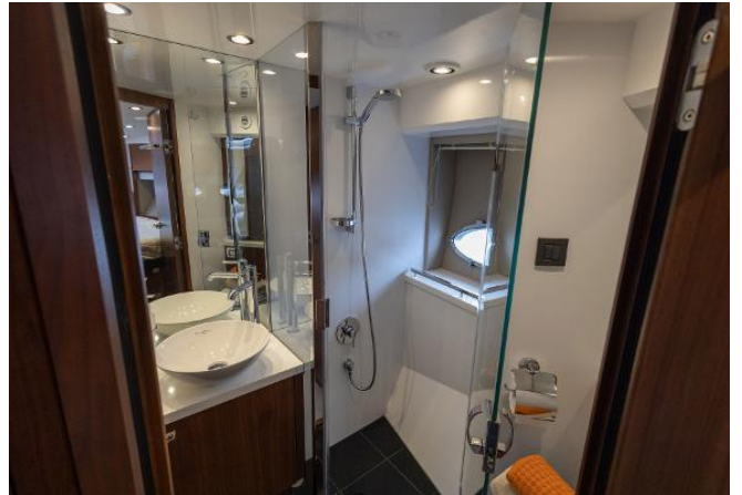
Princess V52 For Sale