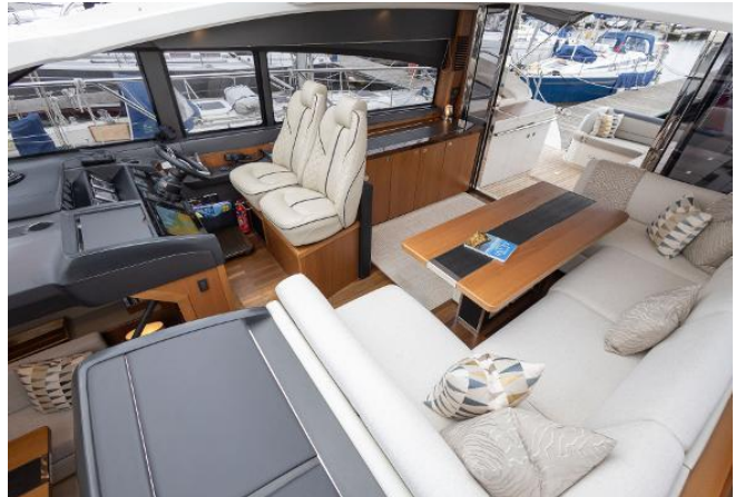
Princess V52 For Sale