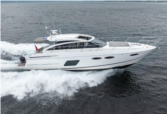
Princess V52 For Sale