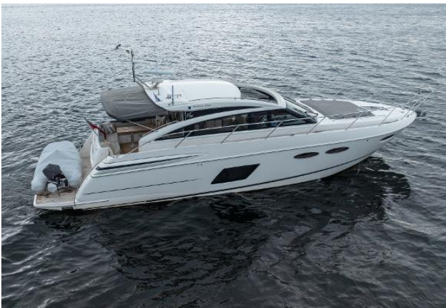
Princess V52 For Sale