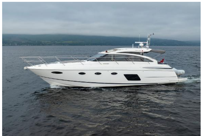
Princess V52 For Sale