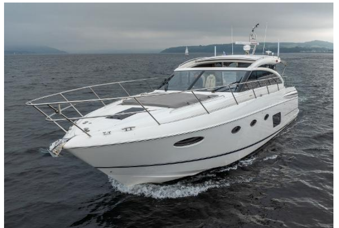
Princess V52 For Sale