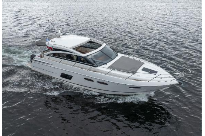
Princess V52 For Sale