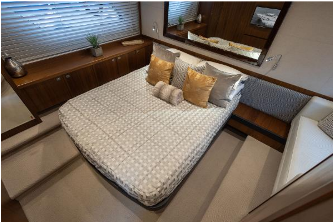
Princess V52 For Sale