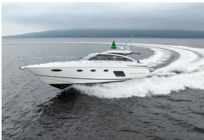
Princess V52 For Sale