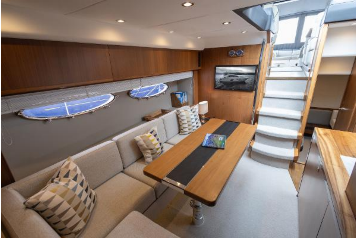
Princess V52 For Sale