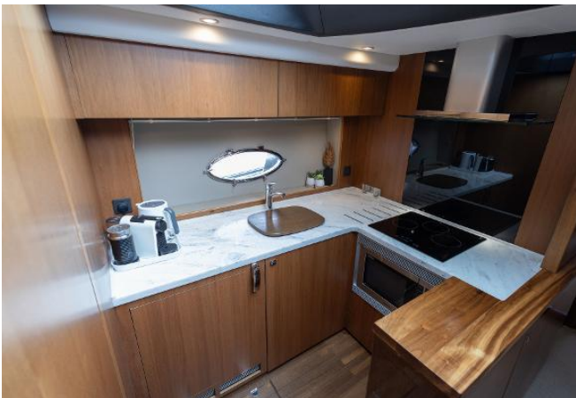
Princess V52 For Sale