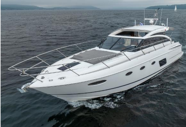
Princess V52 For Sale