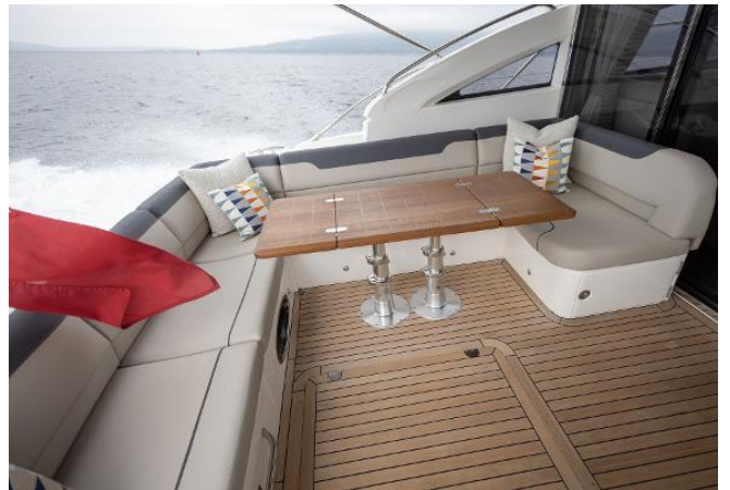
Princess V52 For Sale