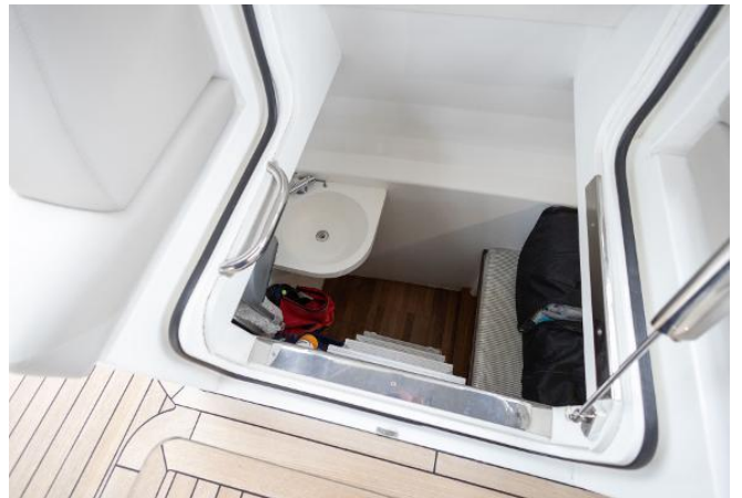
Princess V52 For Sale