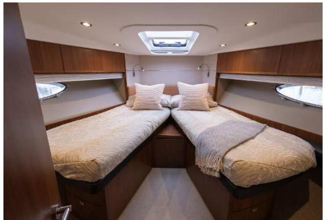
Princess V52 For Sale