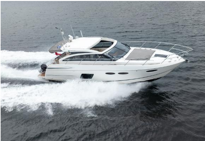
Princess V52 For Sale