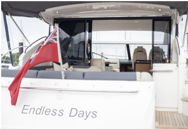
Princess V52 For Sale