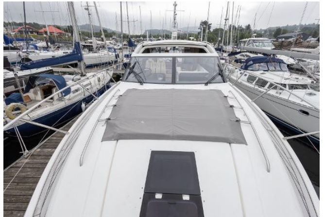
Princess V52 For Sale