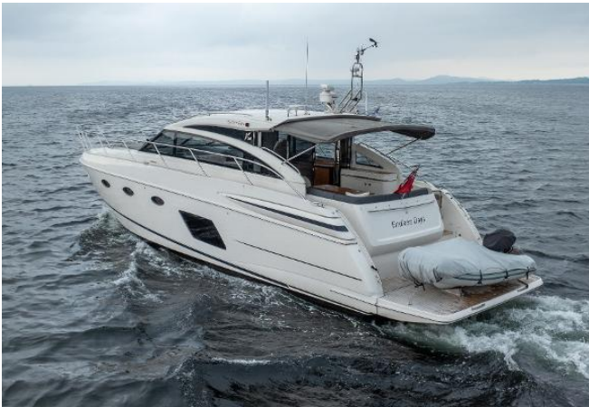
Princess V52 For Sale