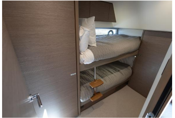
Princess V55 For Sale