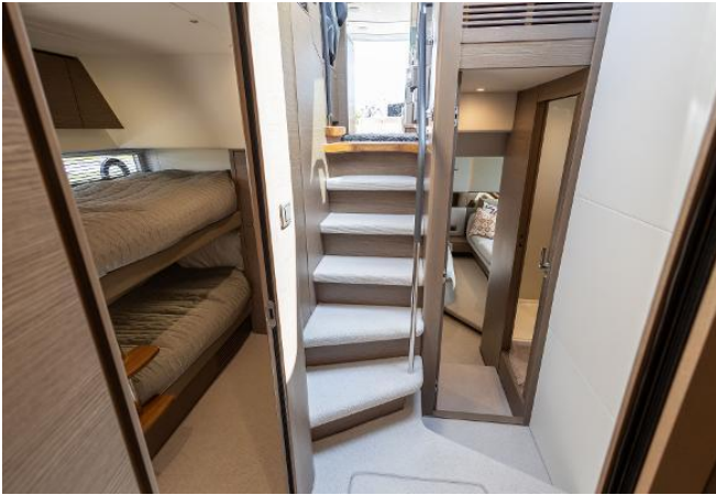
Princess V55 For Sale