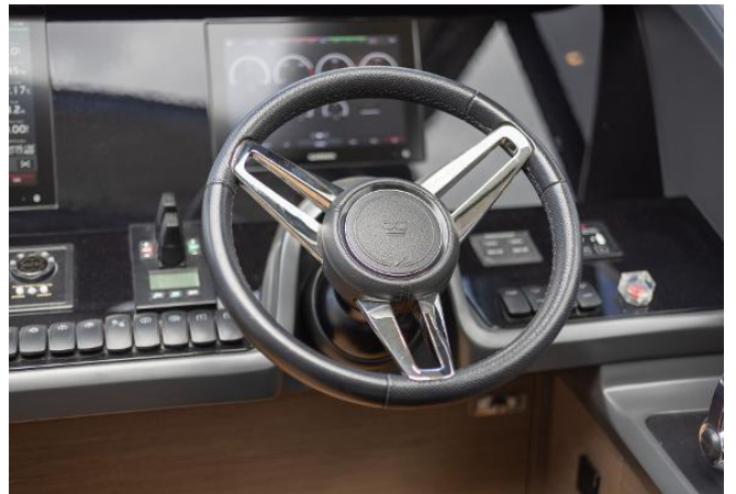
Princess V55 For Sale