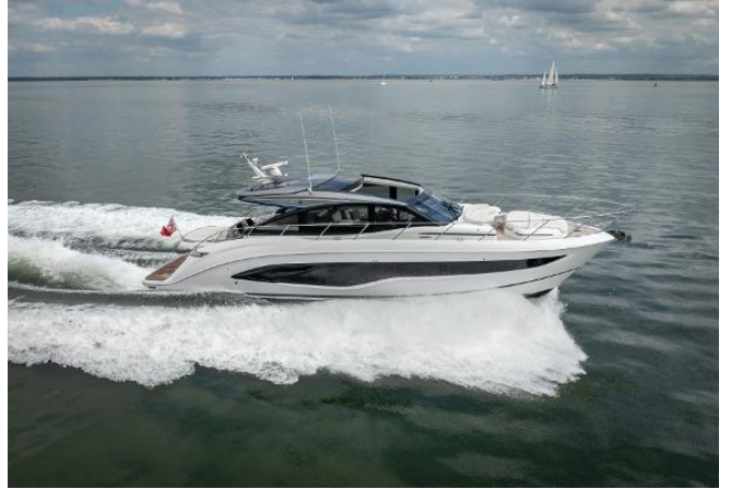
Princess V55 For Sale