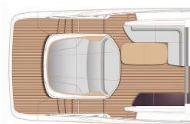
Princess V55 Main Deck Layout Plan