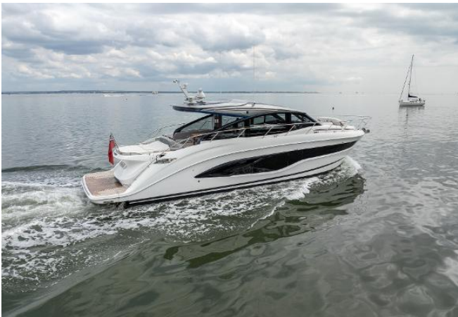
Princess V55 For Sale