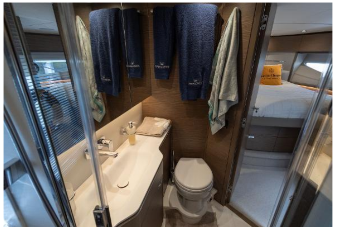
Princess V55 For Sale