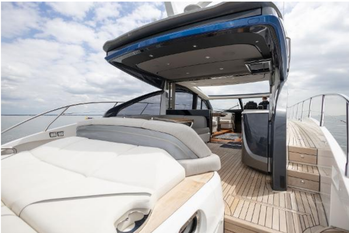
Princess V55 For Sale