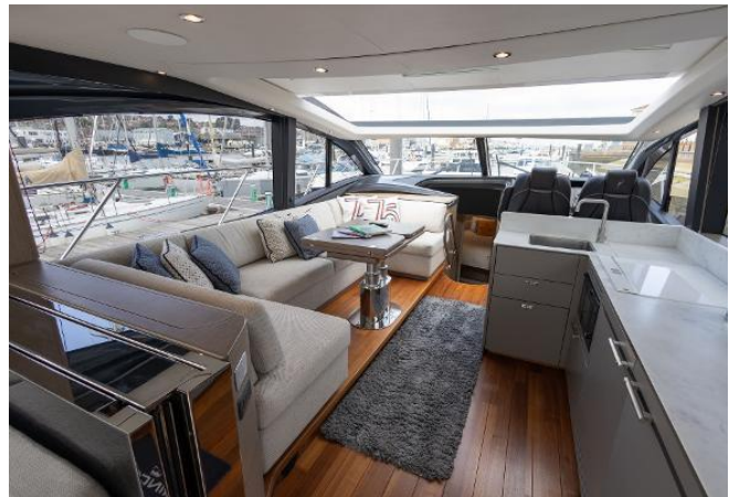
Princess V55 For Sale