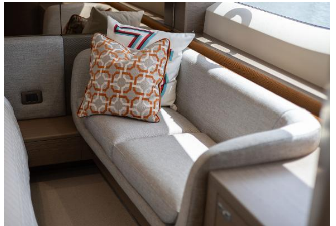
Princess V55 For Sale