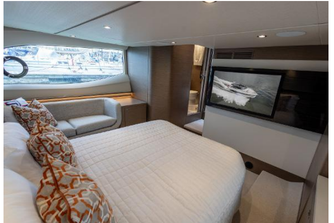
Princess V55 For Sale