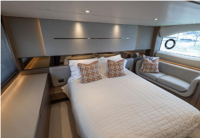
Princess V55 For Sale