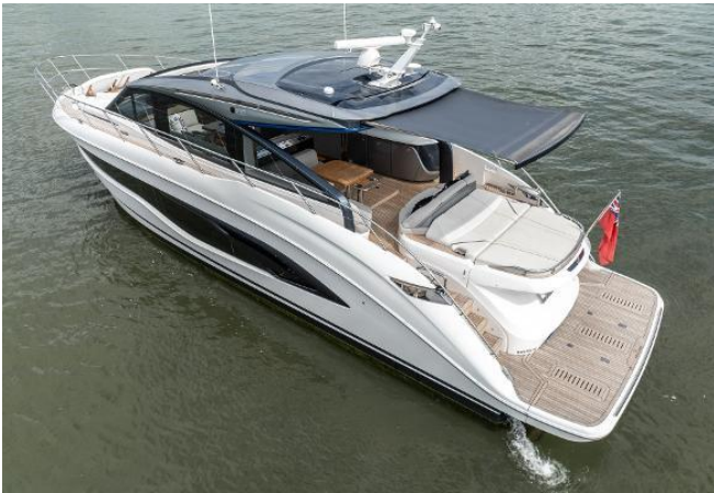
Princess V55 For Sale