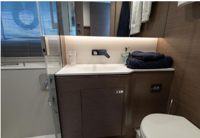
Princess V55 For Sale