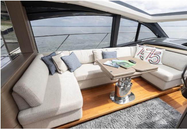
Princess V55 For Sale