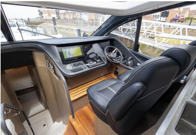
Princess V55 For Sale