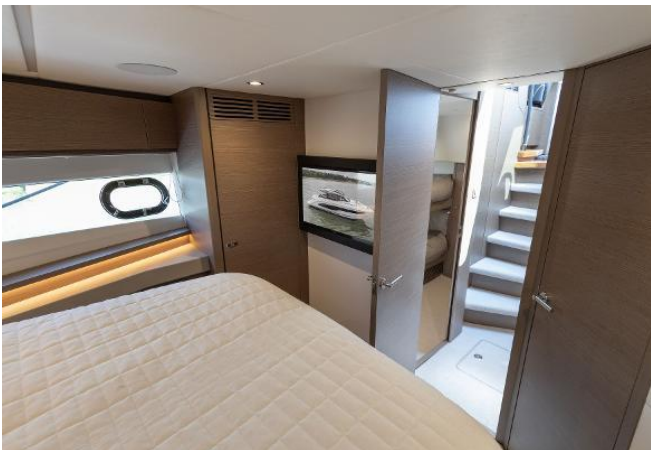
Princess V55 For Sale