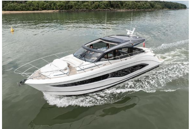
Princess V55 For Sale