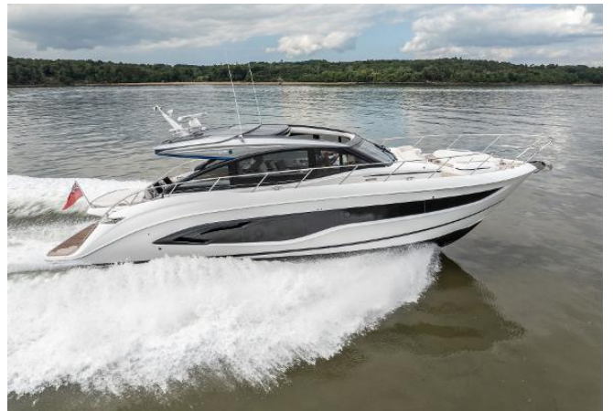
Princess V55 For Sale