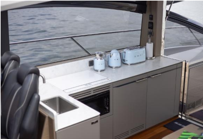
Princess V55 For Sale