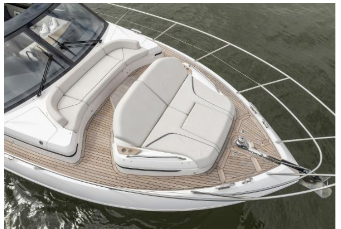
Princess V55 For Sale