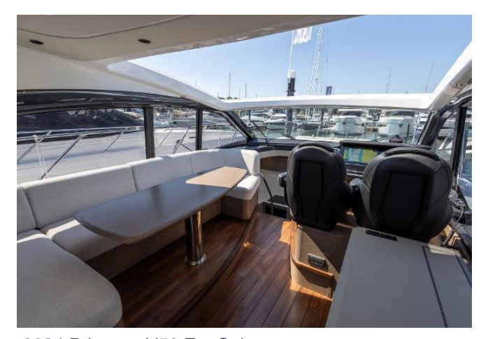
2024 Princess V50 For Sale