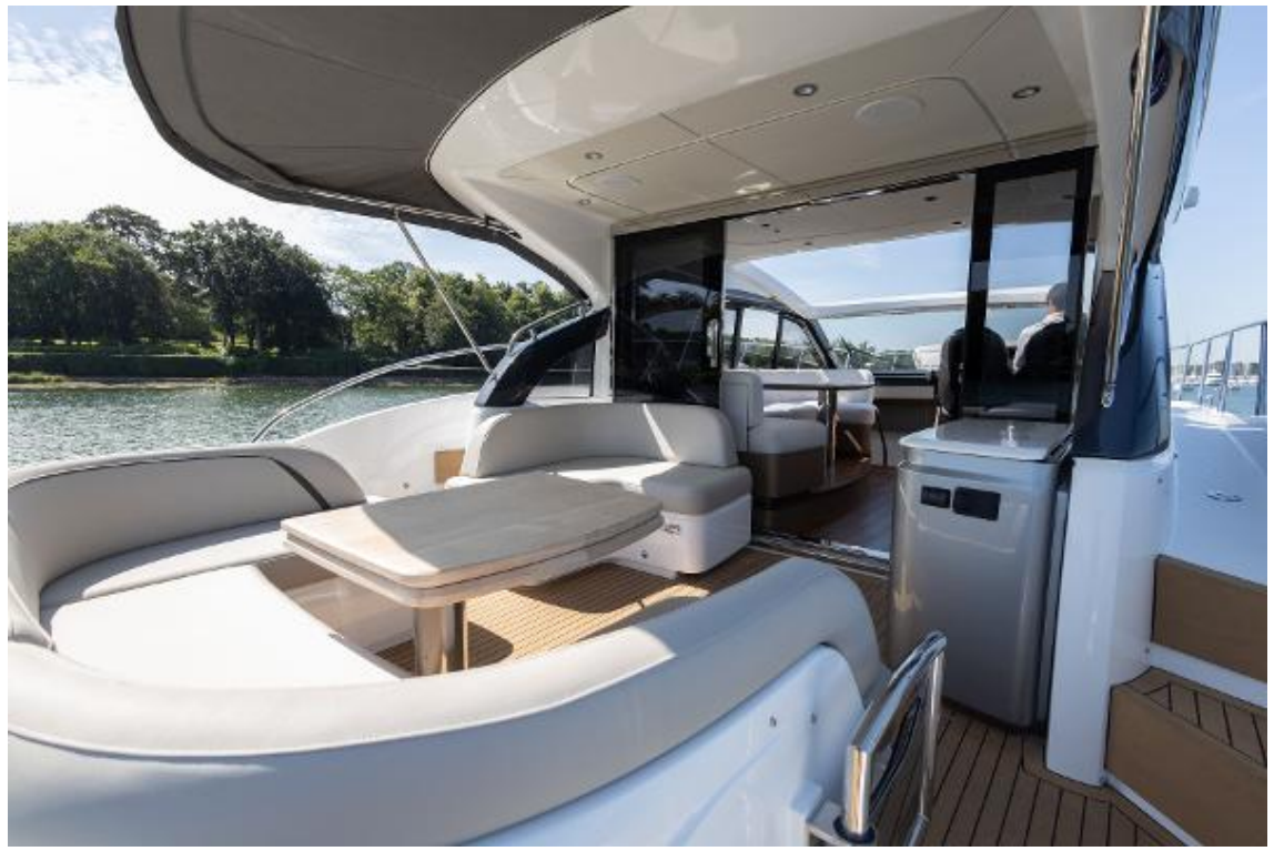
2024 Princess V50 For Sale