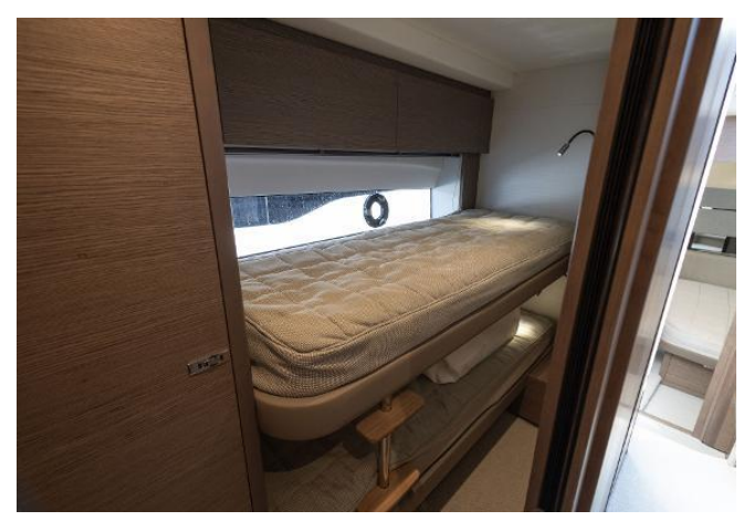
2024 Princess V50 For Sale