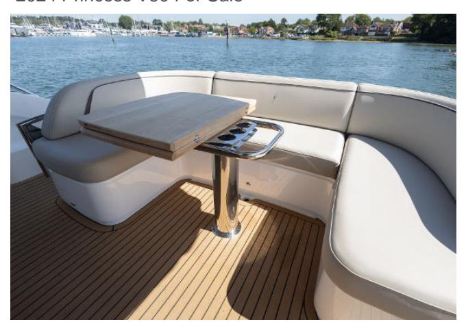
2024 Princess V50 For Sale