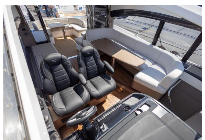
2024 Princess V50 For Sale