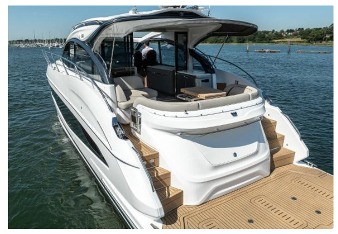
2024 Princess V50 For Sale