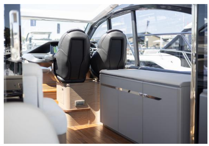
2024 Princess V50 For Sale