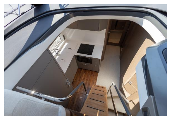
2024 Princess V50 For Sale