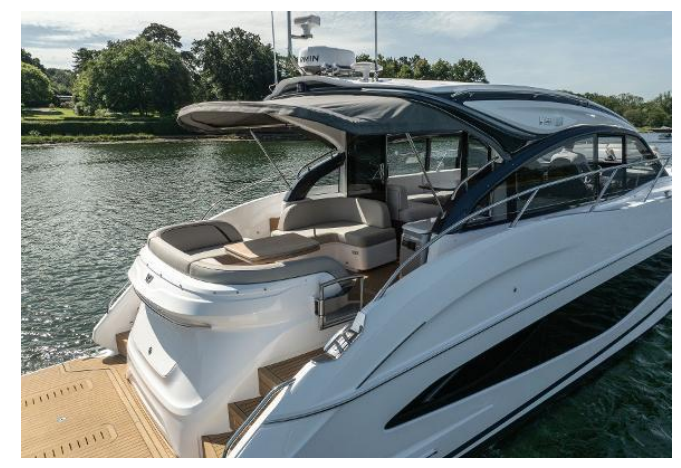
2024 Princess V50 For Sale