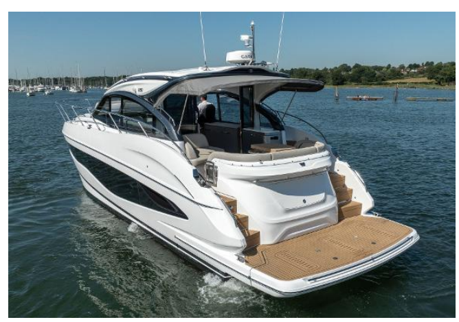
2024 Princess V50 For Sale