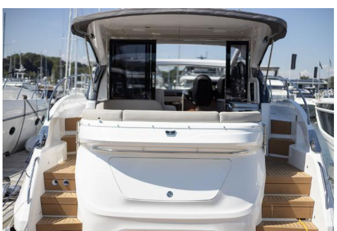
2024 Princess V50 For Sale