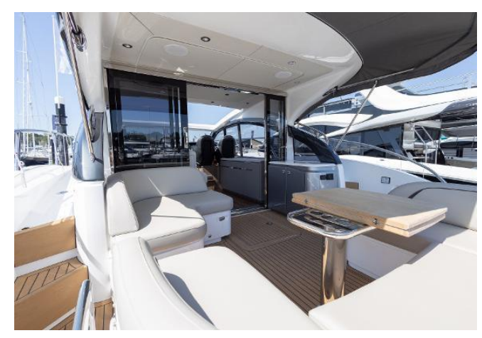
2024 Princess V50 For Sale