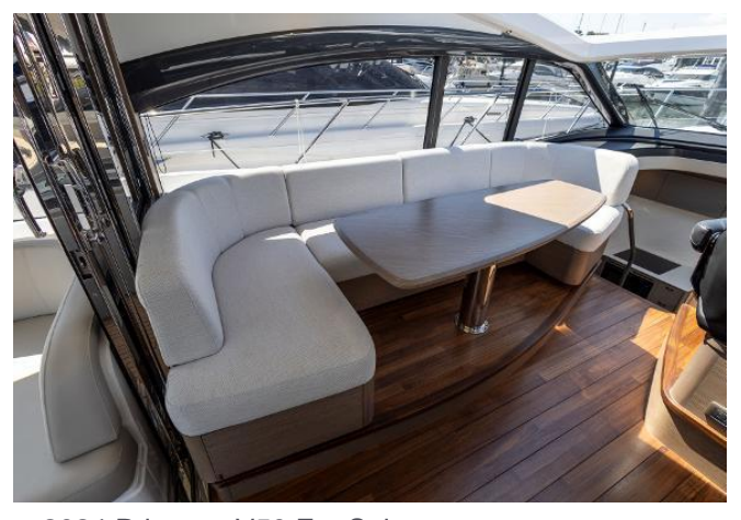
2024 Princess V50 For Sale