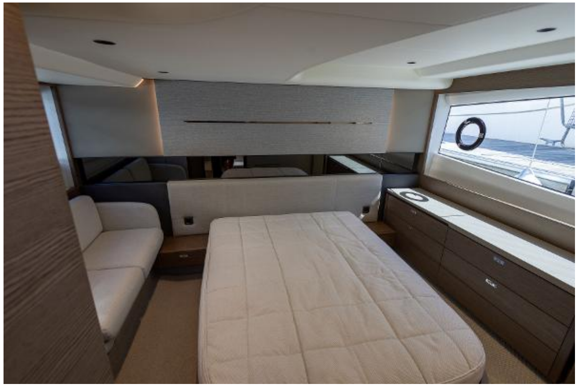
2024 Princess V50 For Sale