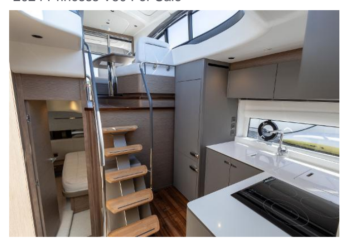
2024 Princess V50 For Sale