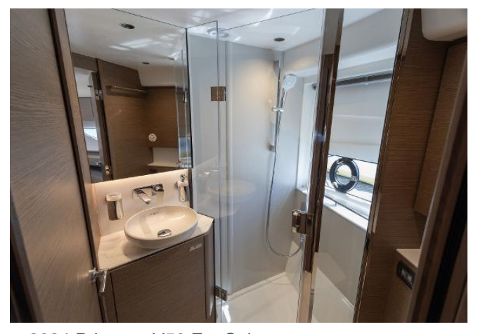
2024 Princess V50 For Sale