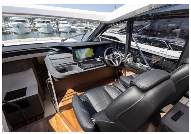
2024 Princess V50 For Sale