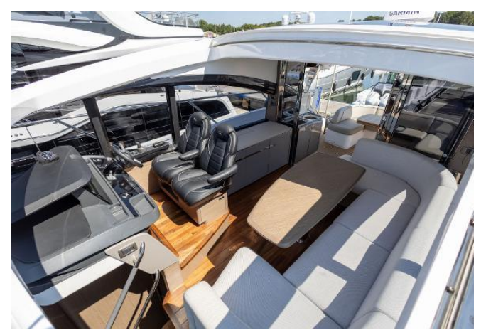
2024 Princess V50 For Sale