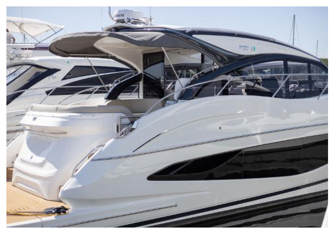
2024 Princess V50 For Sale