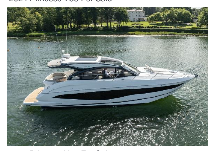
2024 Princess V50 For Sale