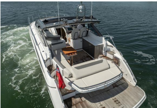
Princess V40 For Sale