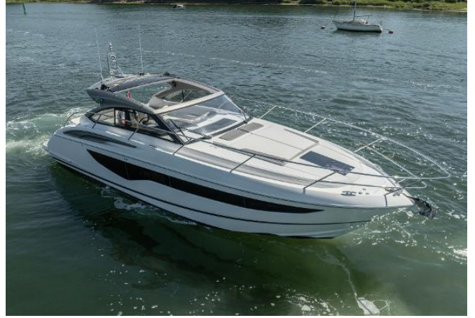
Princess V40 For Sale