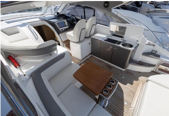
Princess V40 For Sale