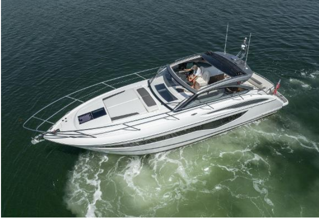
Princess V40 For Sale