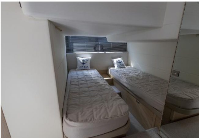
Princess V40 For Sale