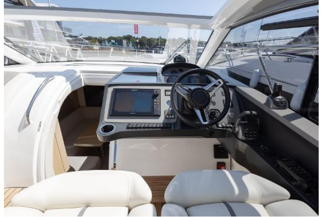
Princess V40 For Sale