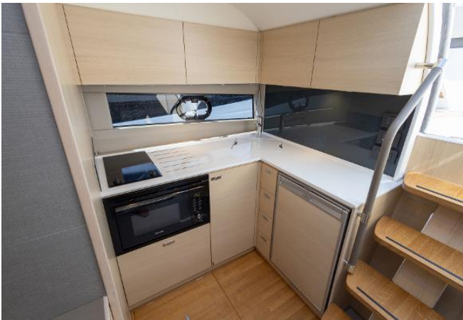
Princess V40 For Sale