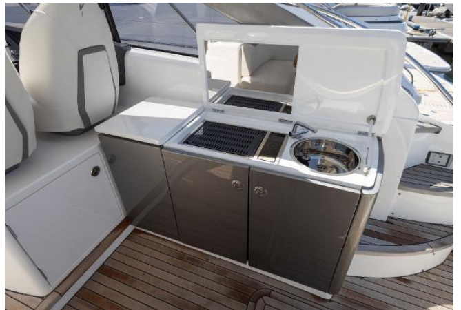
Princess V40 For Sale