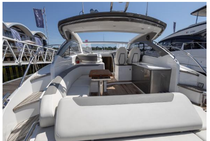
Princess V40 For Sale