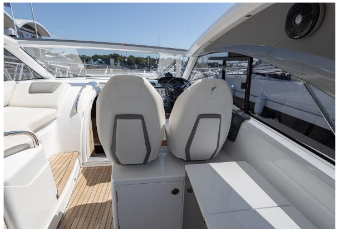
Princess V40 For Sale