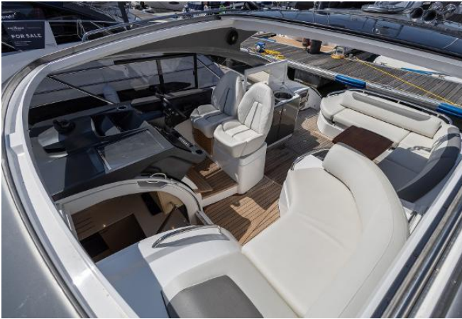
Princess V40 For Sale