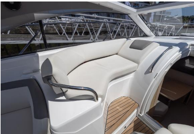
Princess V40 For Sale