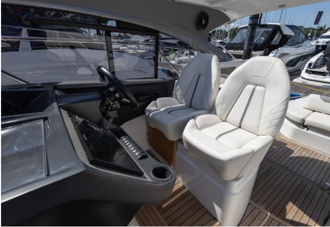
Princess V40 For Sale