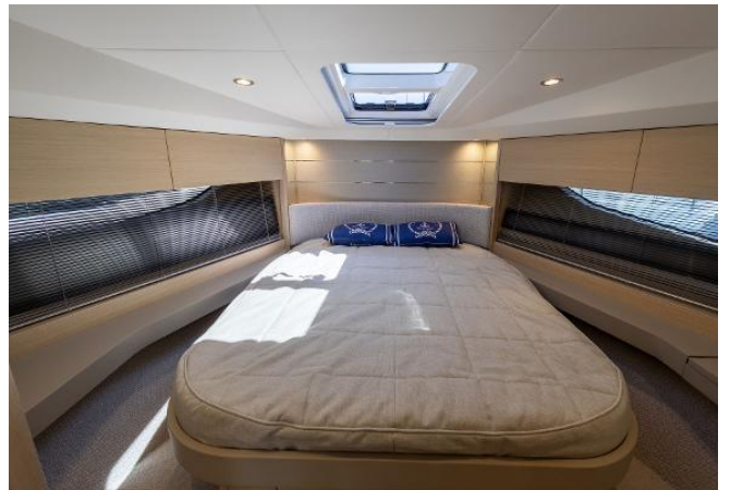
Princess V40 For Sale