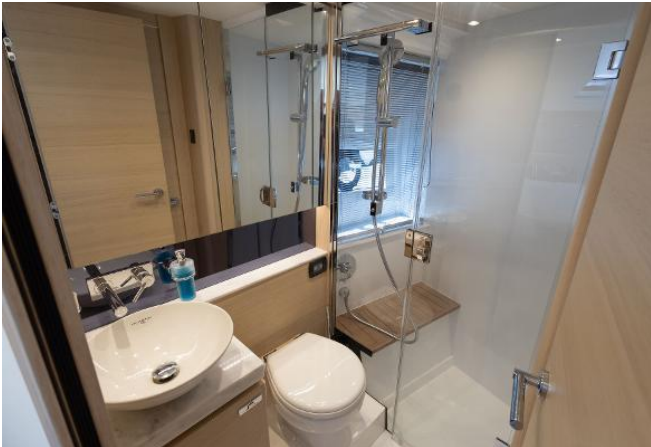
Princess V40 For Sale