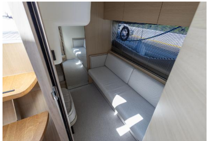
Princess V40 For Sale