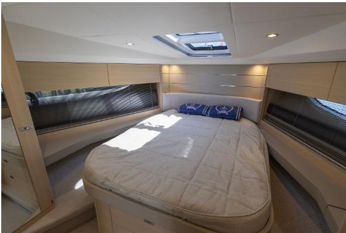
Princess V40 For Sale