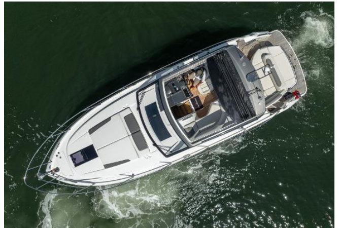
Princess V40 For Sale