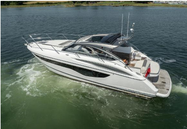
Princess V40 For Sale