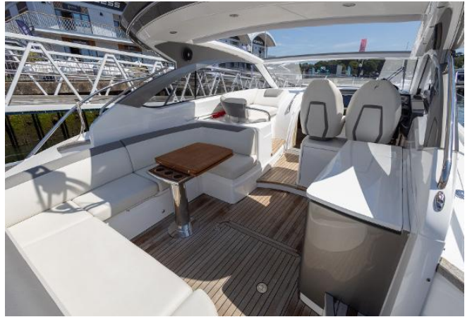
Princess V40 For Sale