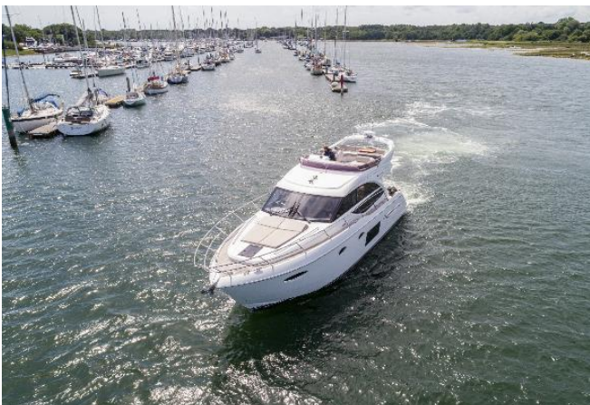
Princess 49 For Sale