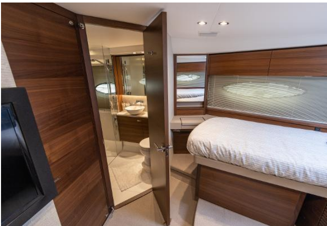
Princess 49 For Sale