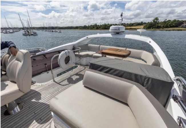
Princess 49 For Sale