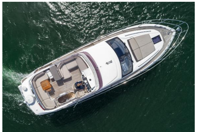
Princess 49 For Sale