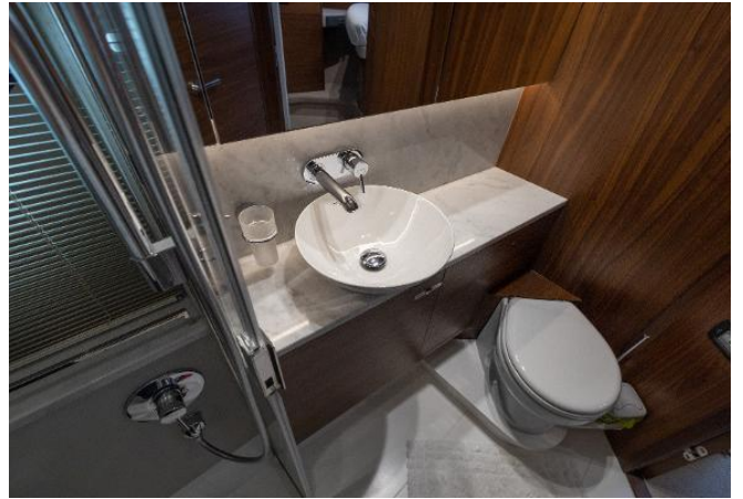
Princess 49 For Sale - Ensuite