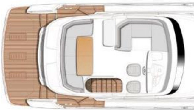
Princess 49 For Sale