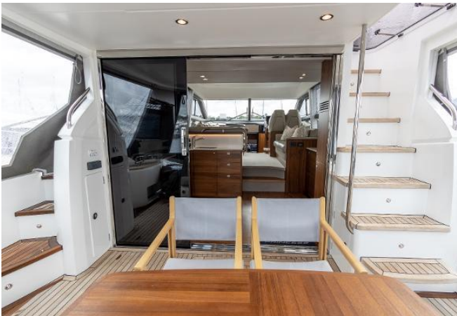
Princess 49 For Sale