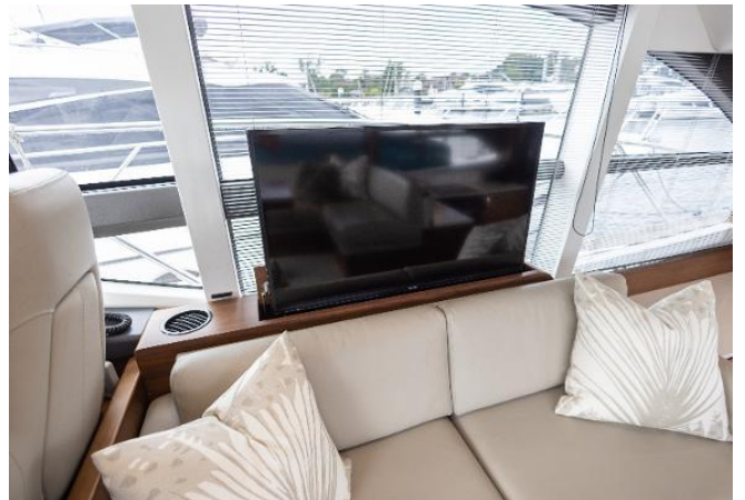
Princess 49 For Sale - Saloon