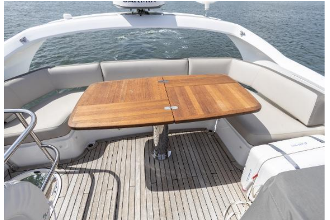
Princess 49 For Sale