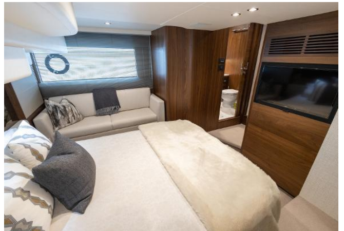
Princess 49 For Sale - Master Cabin