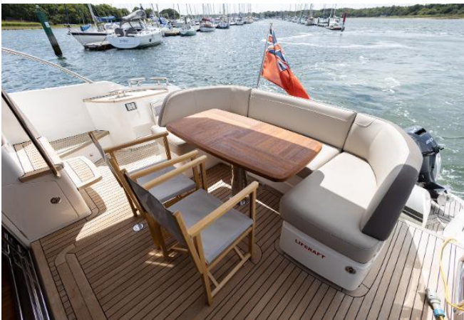
Princess 49 For Sale