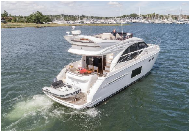
Princess 49 For Sale