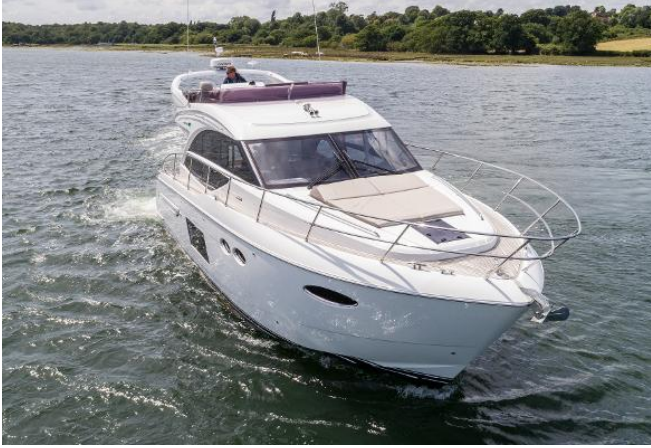
Princess 49 For Sale