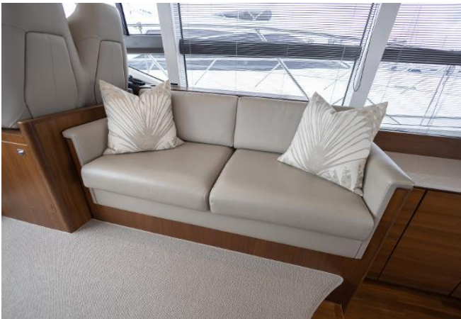
Princess 49 For Sale - Saloon