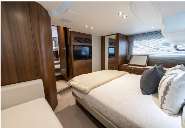
Princess 49 For Sale - Master Cabin