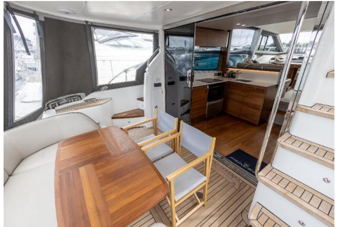
Princess 49 For Sale