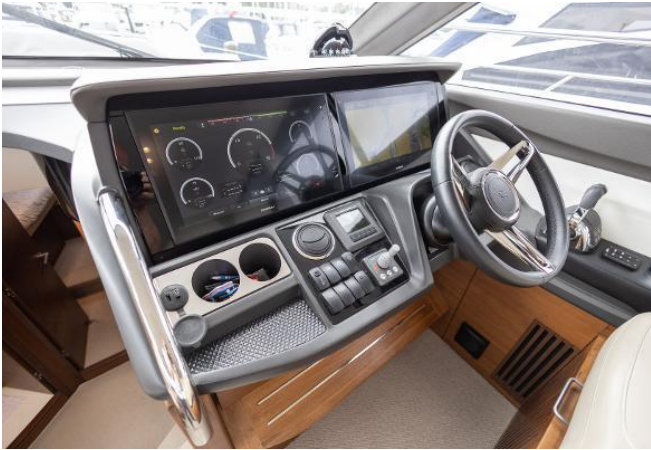
Princess 49 For Sale - Lower Helm