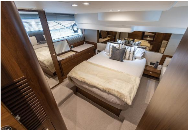
Princess 49 For Sale - Master Cabin