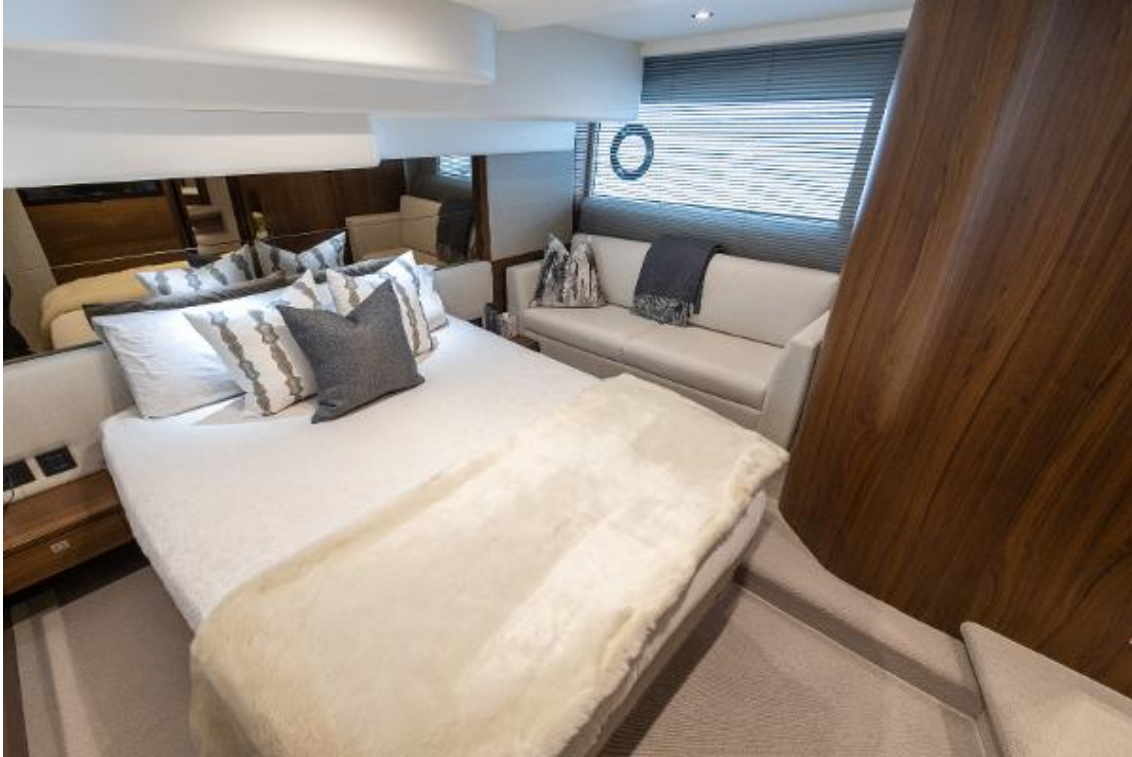
Princess 49 For Sale - Master Cabin