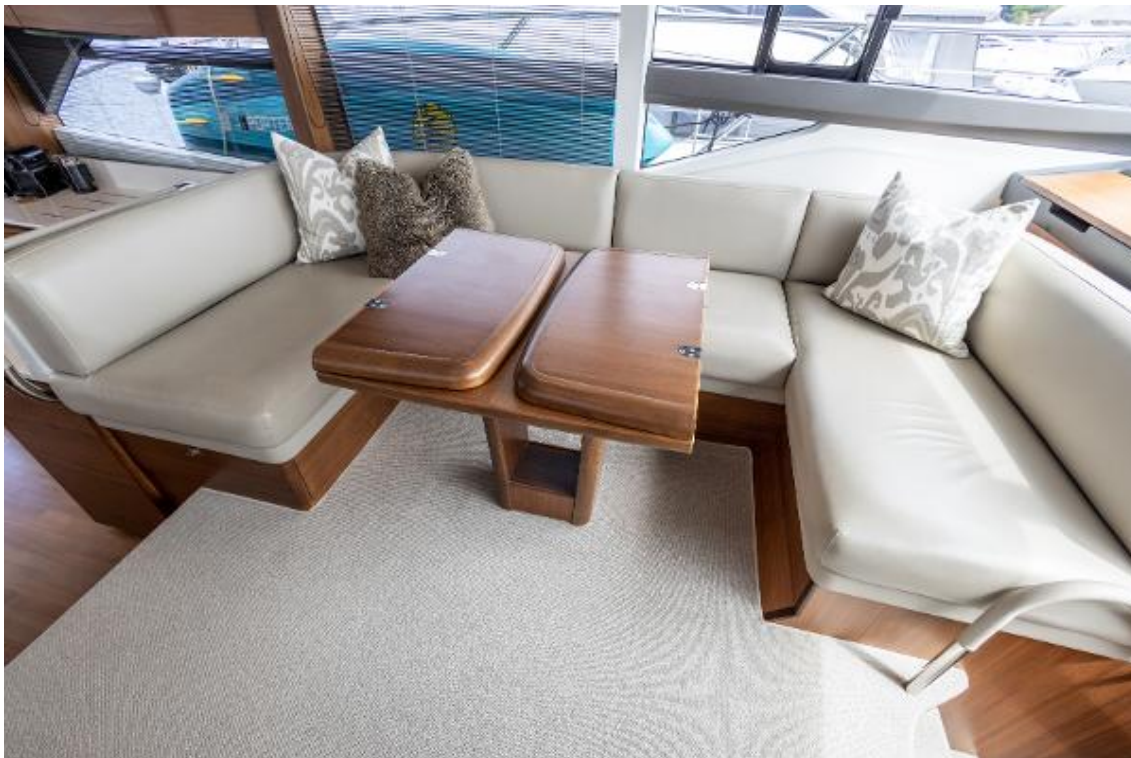
Princess 49 For Sale - Saloon