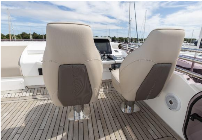
Princess 49 For Sale