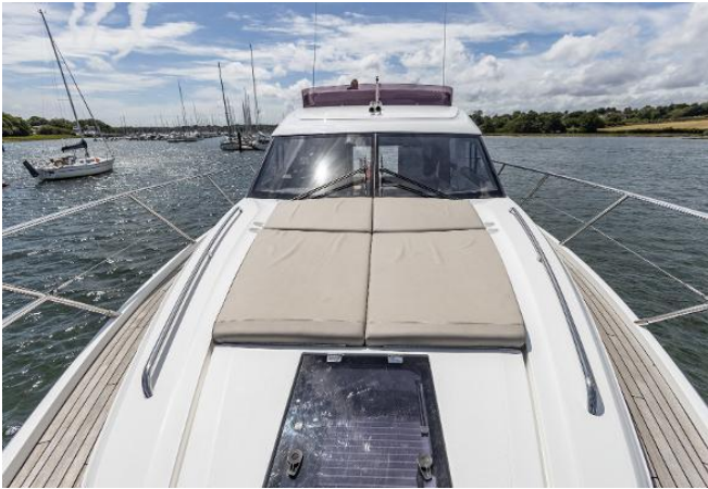
Princess 49 For Sale