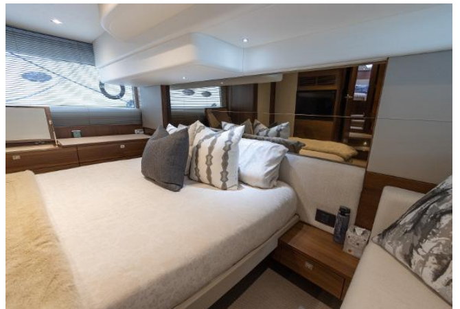
Princess 49 For Sale - Master Cabin