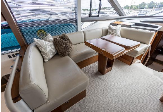
Princess 49 For Sale - Saloon