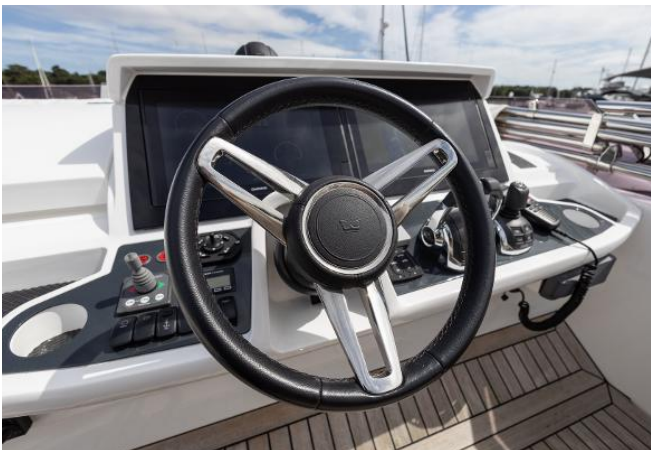
Princess 49 For Sale