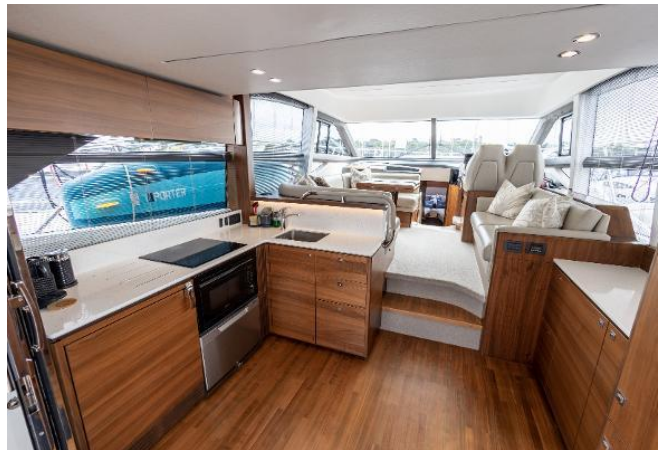
Princess 49 For Sale - Galley