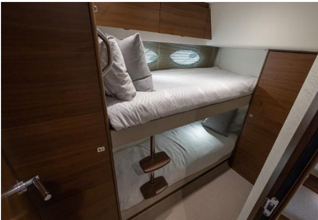
Princess 49 For Sale - Bunk Cabin