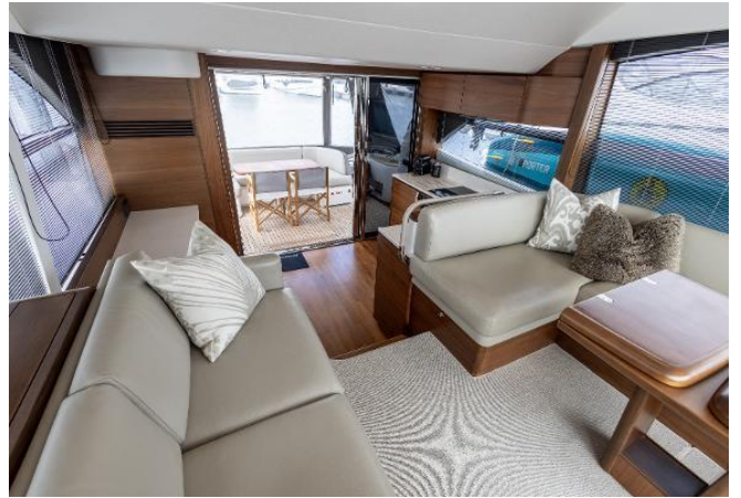
Princess 49 For Sale - Saloon