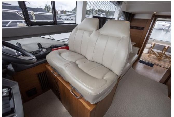
Princess 49 For Sale - Lower Helm