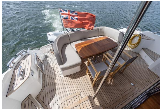
Princess 49 For Sale