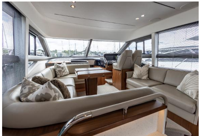
Princess 49 For Sale - Saloon