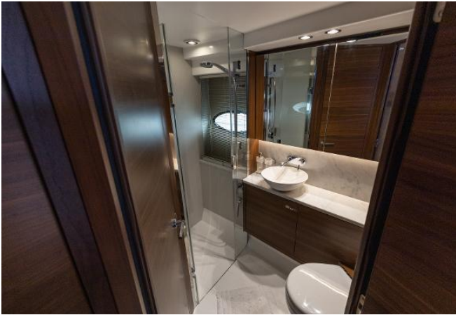
Princess 49 For Sale - Ensuite