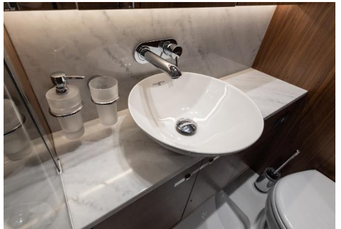
Princess 49 For Sale - Ensuite