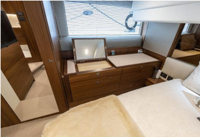
Princess 49 For Sale - Master Cabin