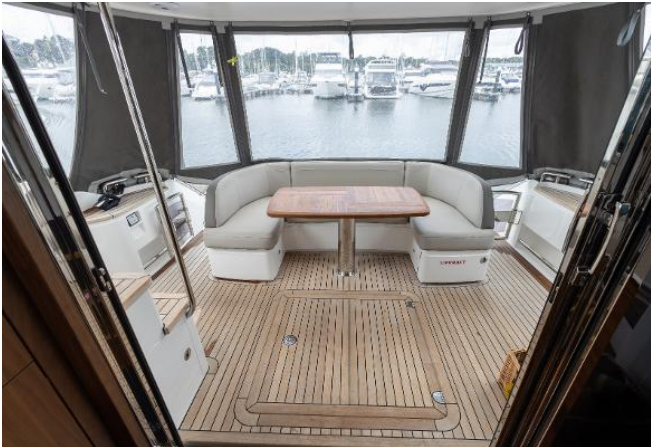
Princess 49 For Sale