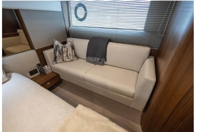
Princess 49 For Sale - Master Cabin