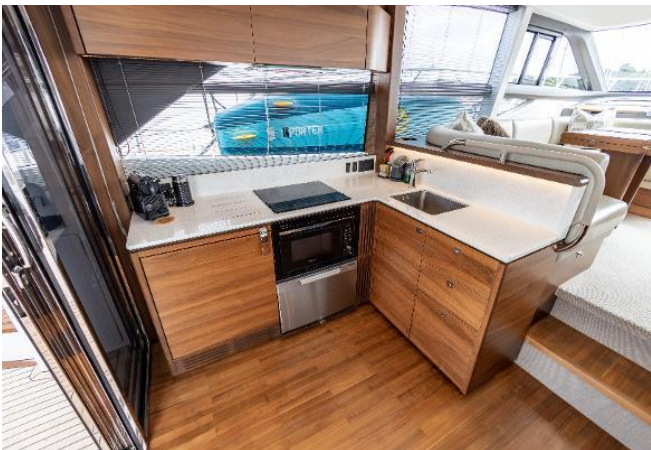
Princess 49 For Sale - Galley