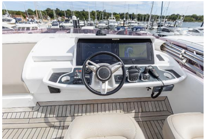
Princess 49 For Sale