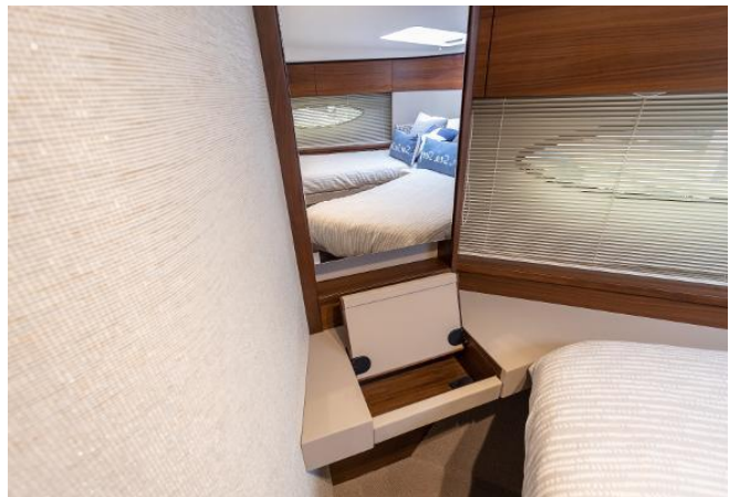
Princess 49 For Sale