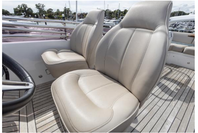
Princess 49 For Sale