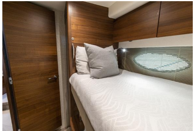
Princess 49 For Sale - Bunk Cabin