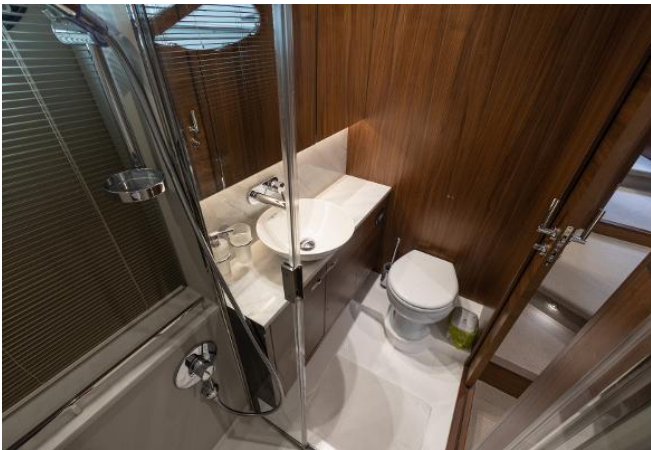
Princess 49 For Sale - Ensuite