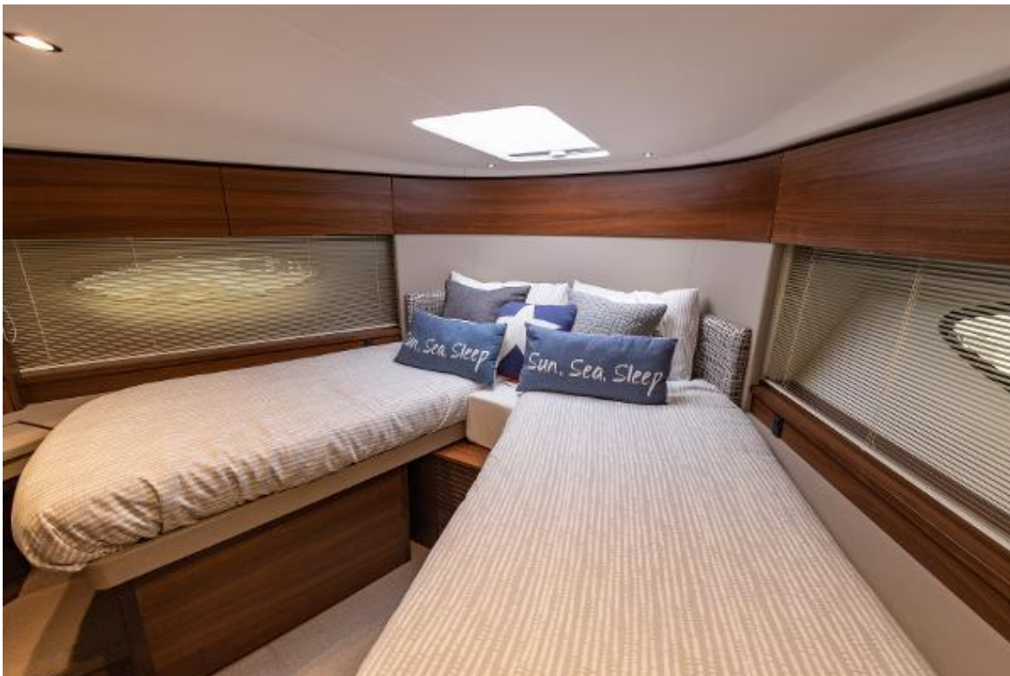
Princess 49 For Sale - Guest Cabin