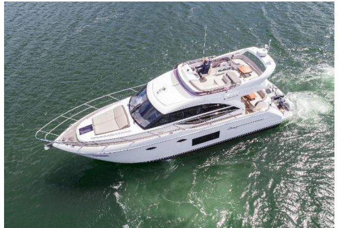
Princess 49 For Sale