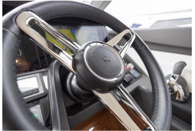
Princess 49 For Sale - Lower Helm