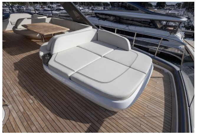
Princess Y72 For Sale