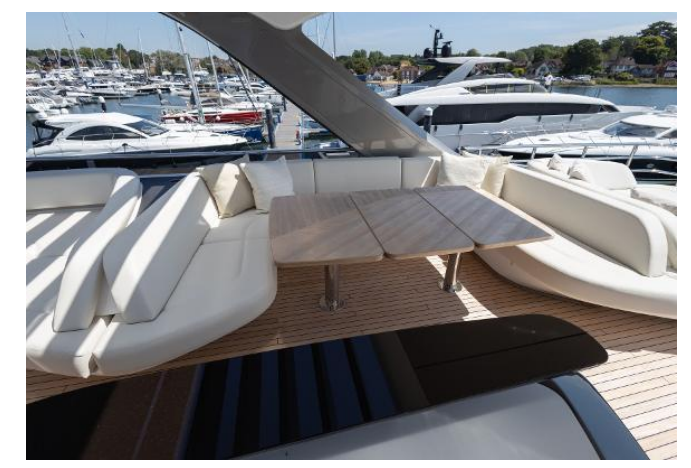
Princess Y72 For Sale