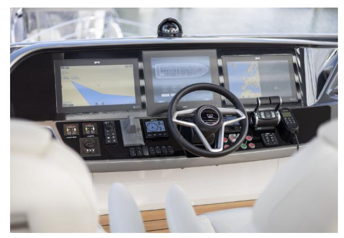
Princess Y72 For Sale