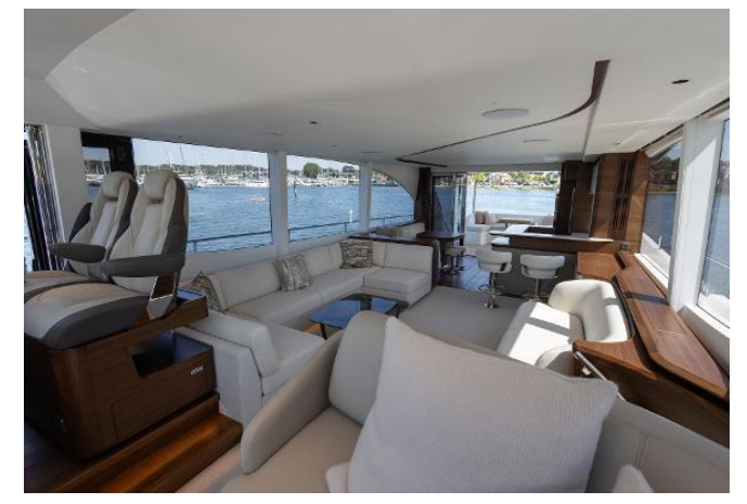
Princess Y72 For Sale