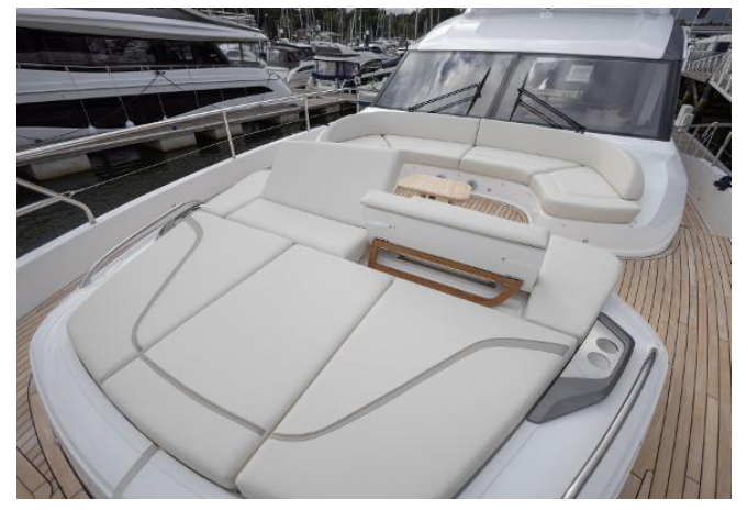
Princess Y72 For Sale