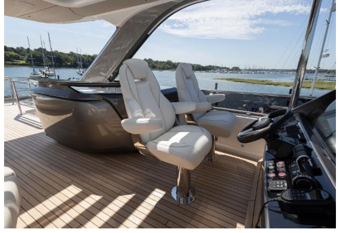
Princess Y72 For Sale