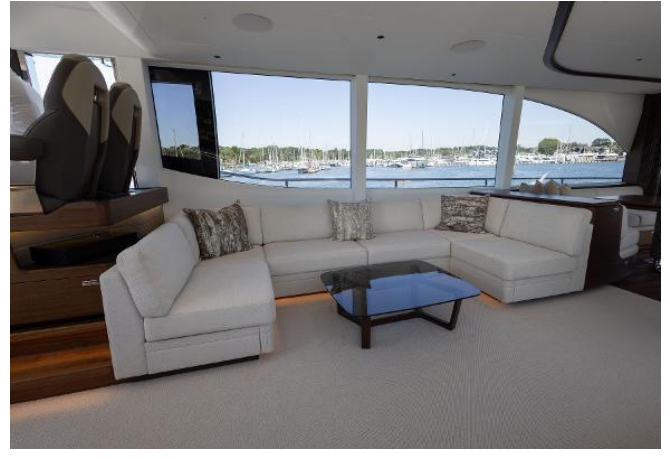
Princess Y72 For Sale