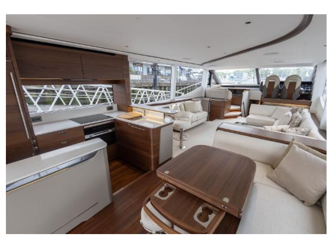
Princess Y72 For Sale