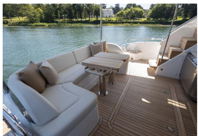
Princess Y72 For Sale