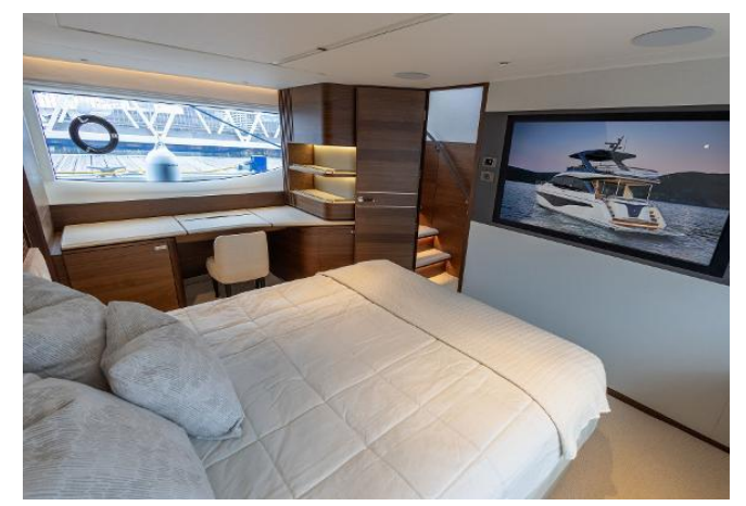
Princess Y72 For Sale