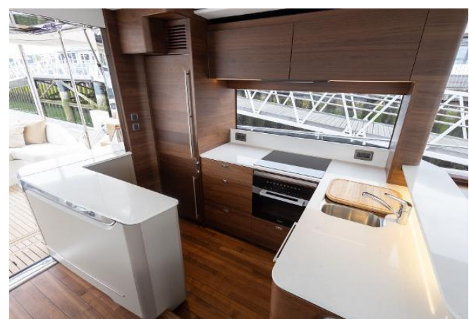
Princess Y72 For Sale