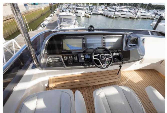
Princess Y72 For Sale