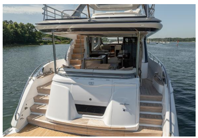
Princess Y72 For Sale