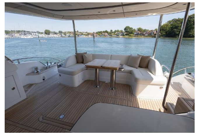
Princess Y72 For Sale