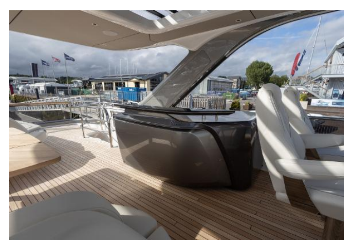
Princess Y72 For Sale