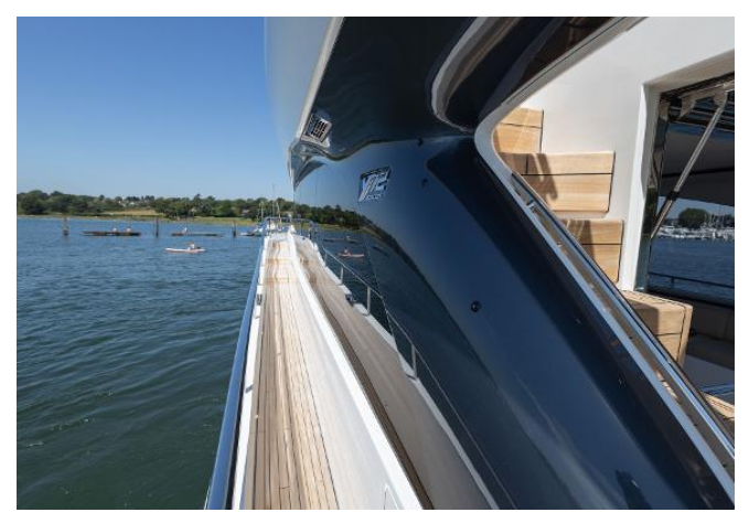
Princess Y72 For Sale