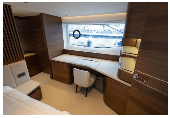
Princess Y72 For Sale