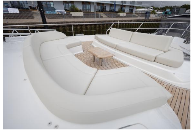
Princess Y72 For Sale