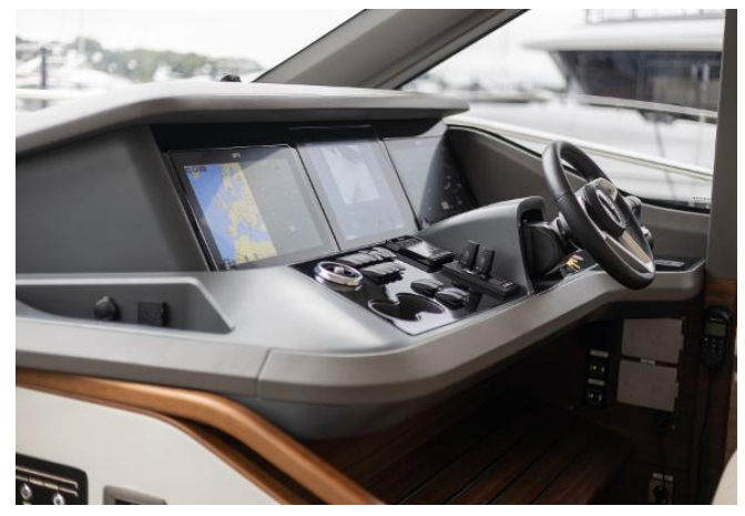
Princess Y72 For Sale