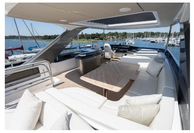
Princess Y72 For Sale