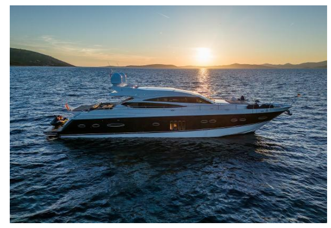
Princess V78 For Sale