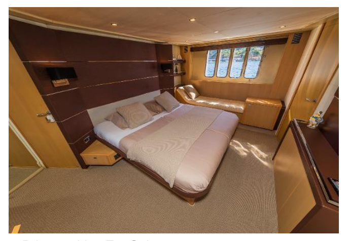
Princess V78 For Sale