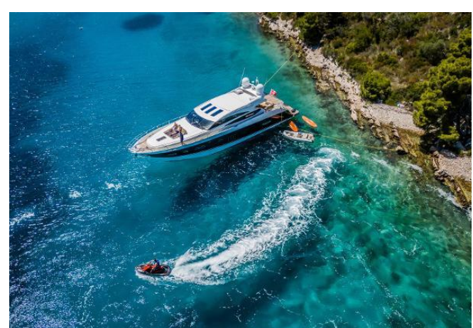
Princess V78 For Sale