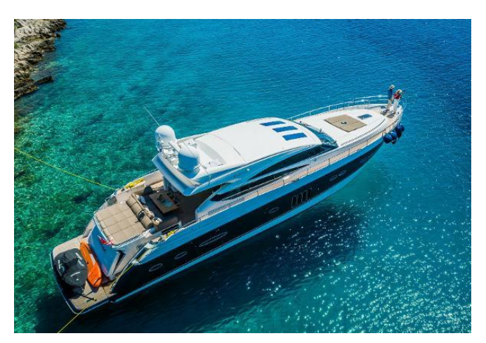
Princess V78 For Sale