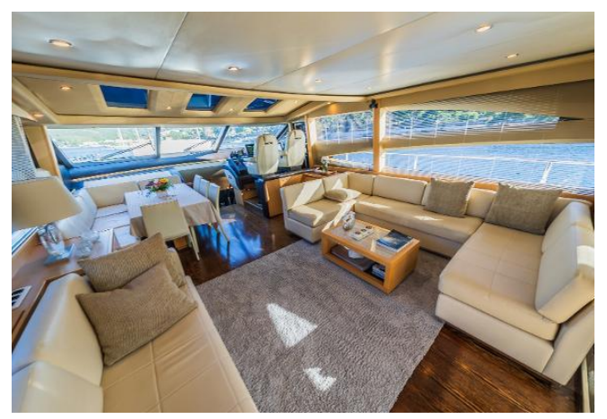
Princess V78 For Sale