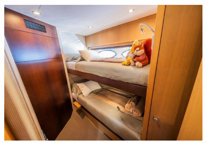
Princess V78 For Sale