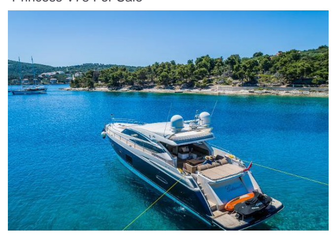
Princess V78 For Sale