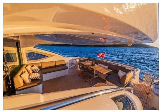
Princess V78 For Sale