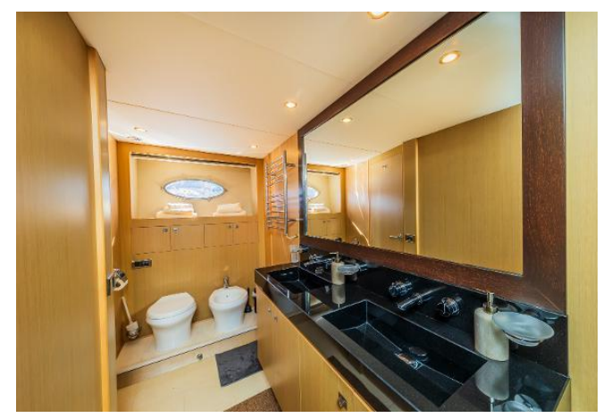
Princess V78 For Sale