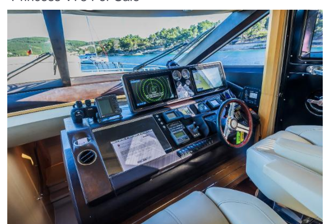
Princess V78 For Sale