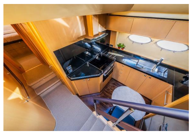
Princess V78 For Sale