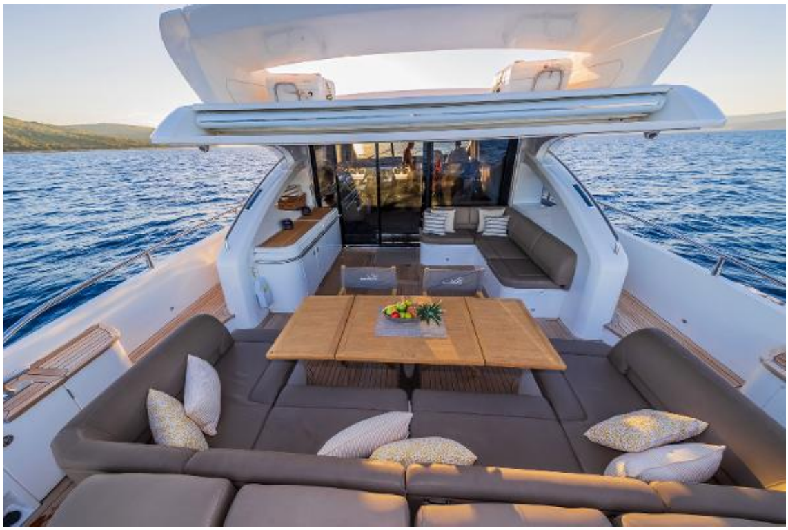
Princess V78 For Sale

Email: de-brokerage@princessmysales.com Tel: +49 (0)160 616 1640