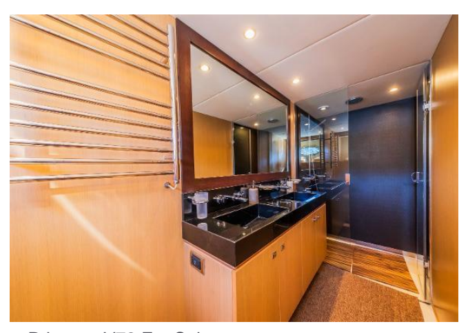
Princess V78 For Sale