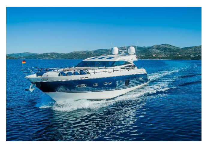
Princess V78 For Sale