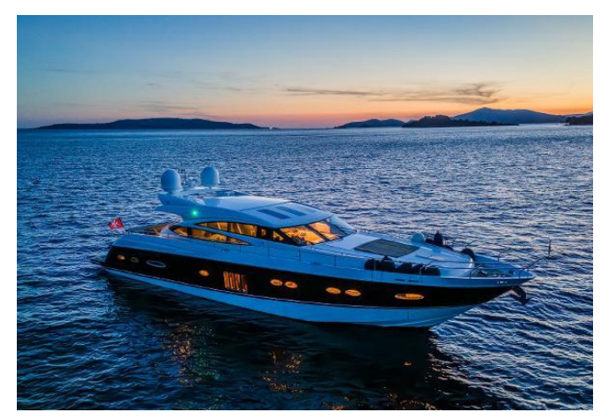
Princess V78 For Sale