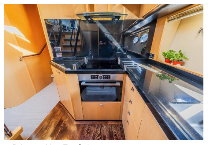
Princess V78 For Sale