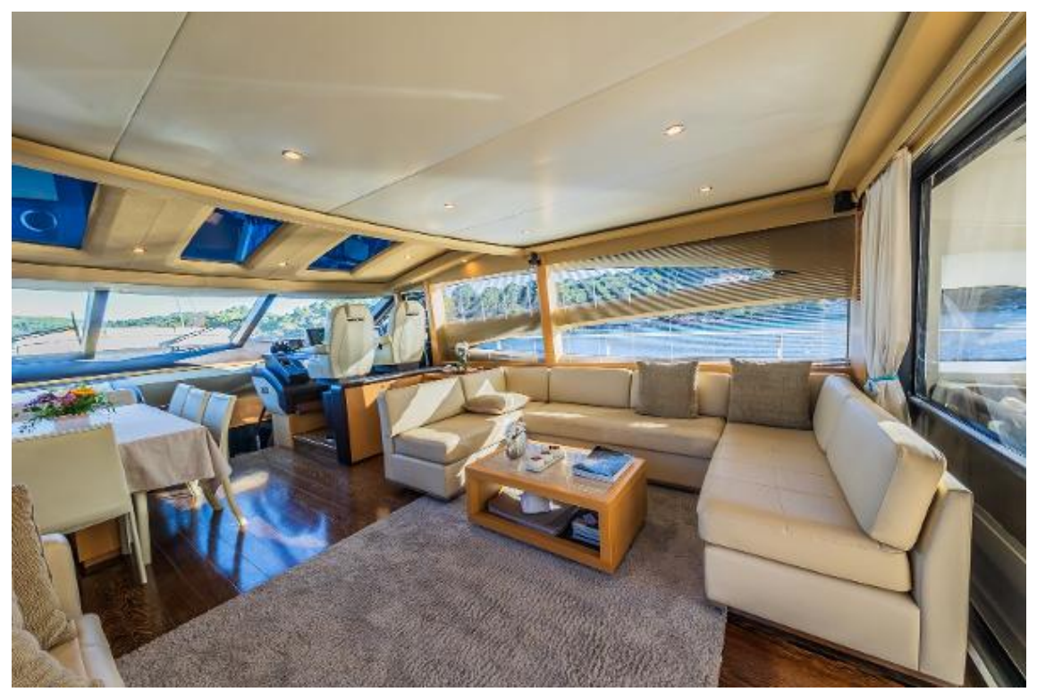
Princess V78 For Sale