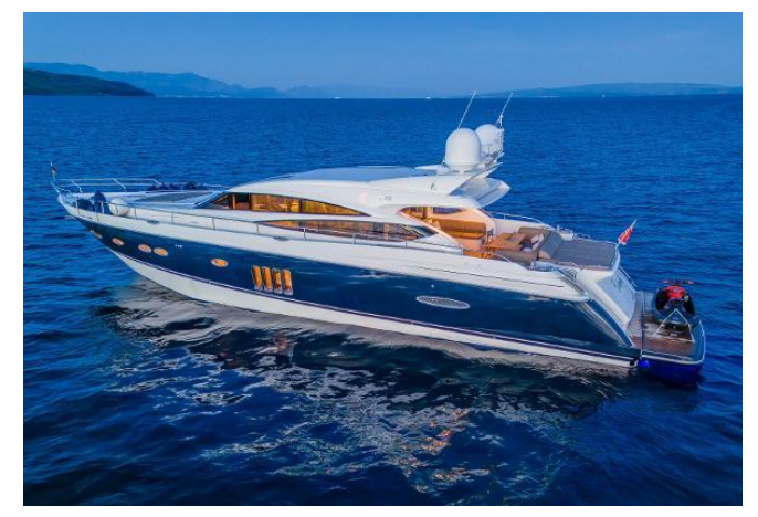
Princess V78 For Sale