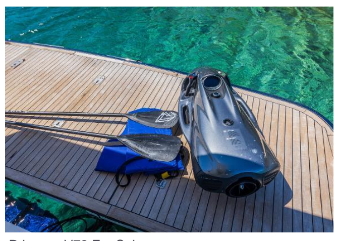
Princess V78 For Sale