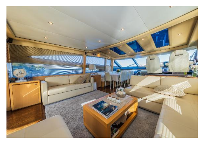
Princess V78 For Sale