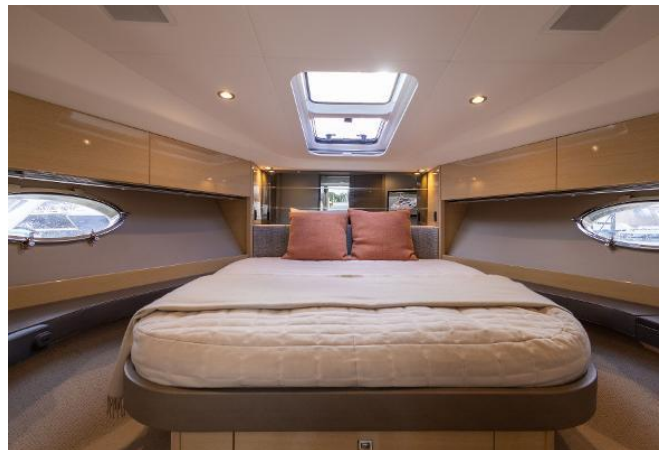
Princess V39 For Sale