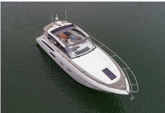
Princess V39 For Sale