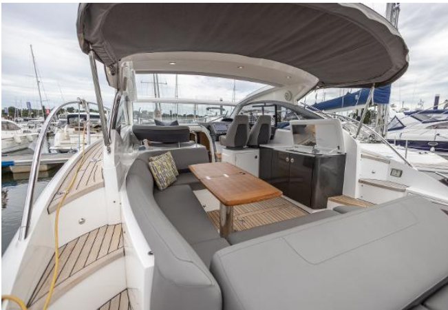
Princess V39 For Sale