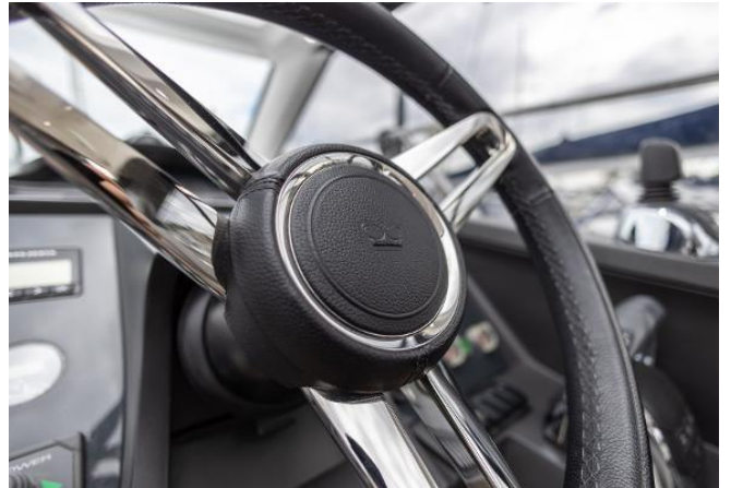
Princess V39 For Sale