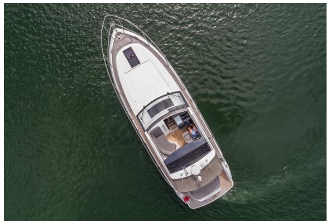
Princess V39 For Sale