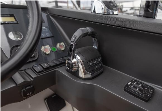
Princess V39 For Sale