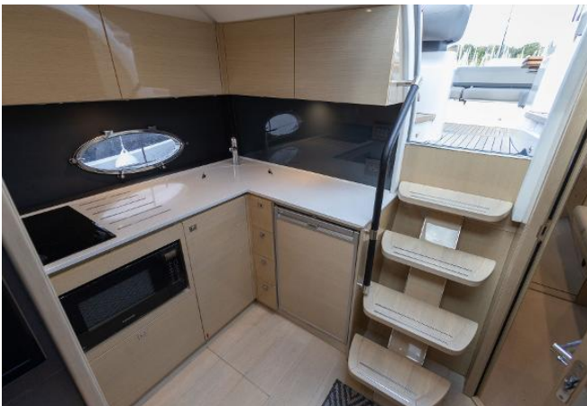
Princess V39 For Sale