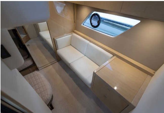
Princess V39 For Sale