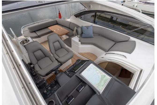
Princess V39 For Sale