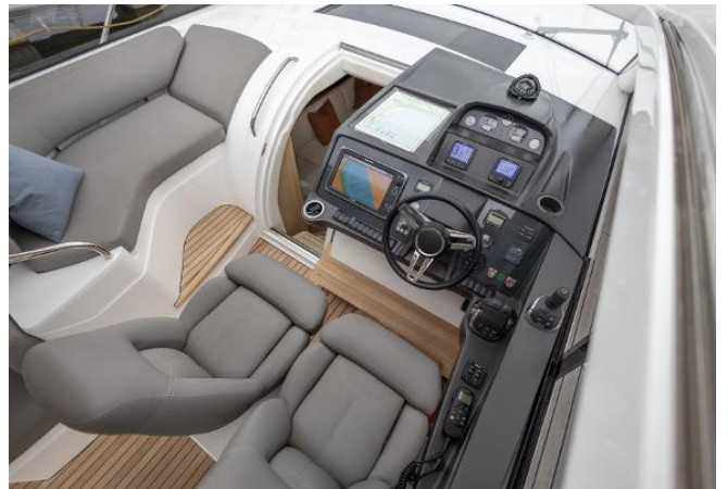
Princess V39 For Sale