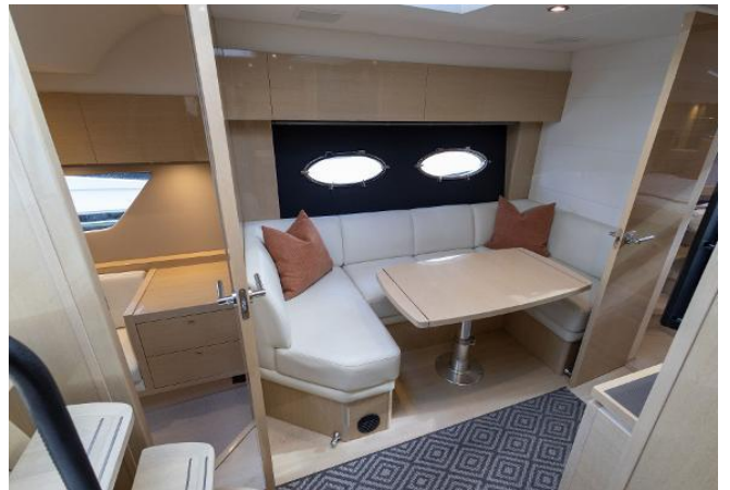
Princess V39 For Sale