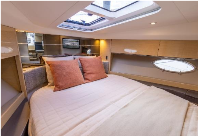
Princess V39 For Sale