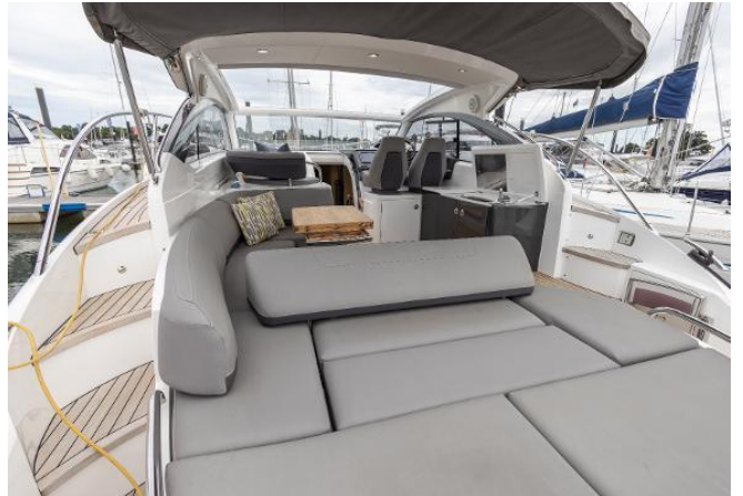
Princess V39 For Sale