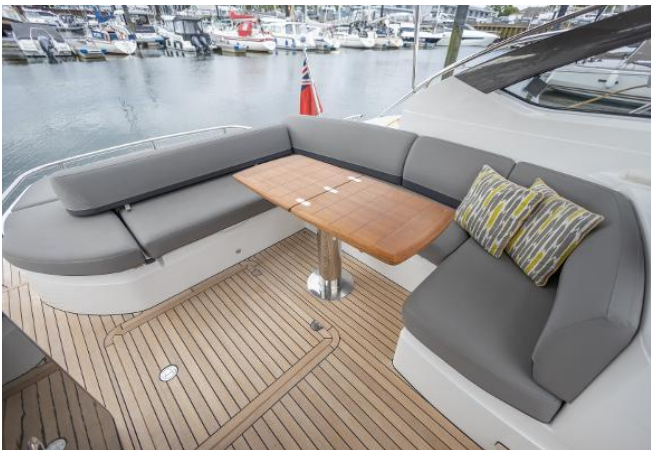
Princess V39 For Sale