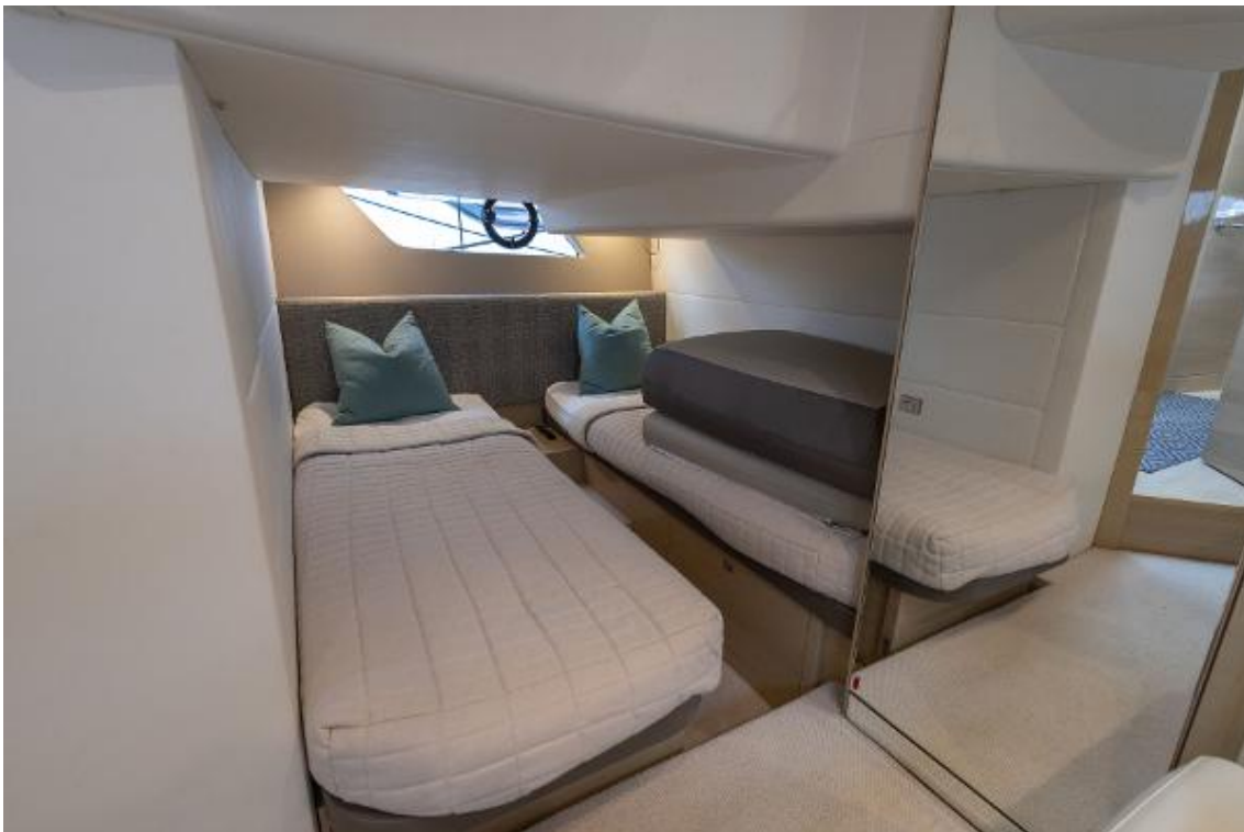
Princess V39 For Sale