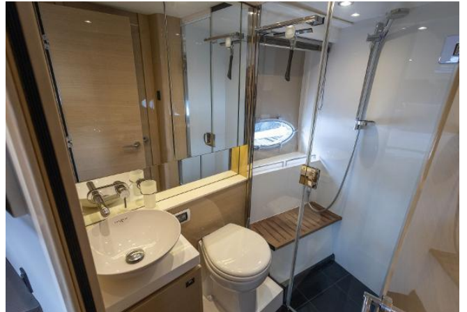
Princess V39 For Sale