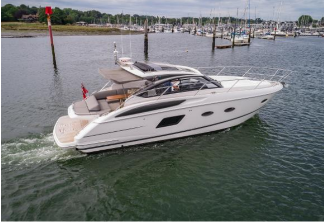
Princess V39 For Sale