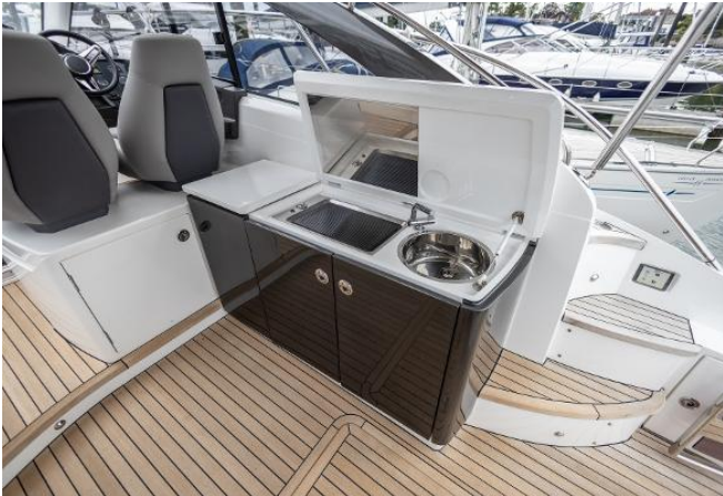
Princess V39 For Sale