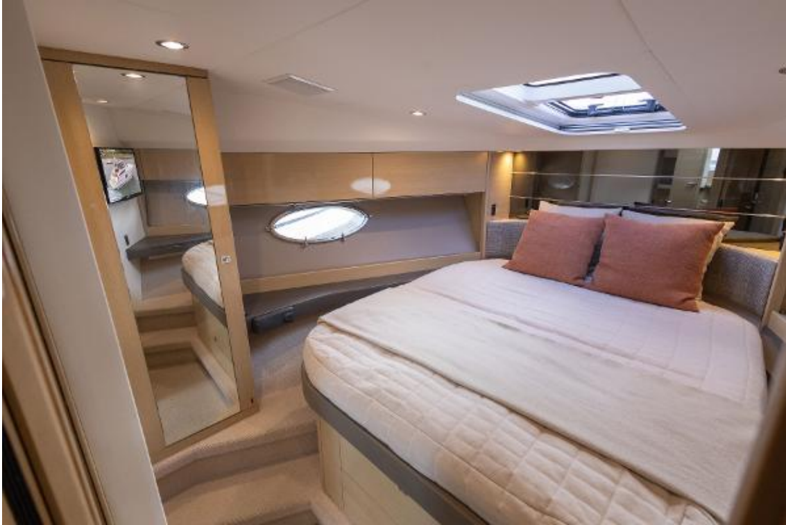
Princess V39 For Sale