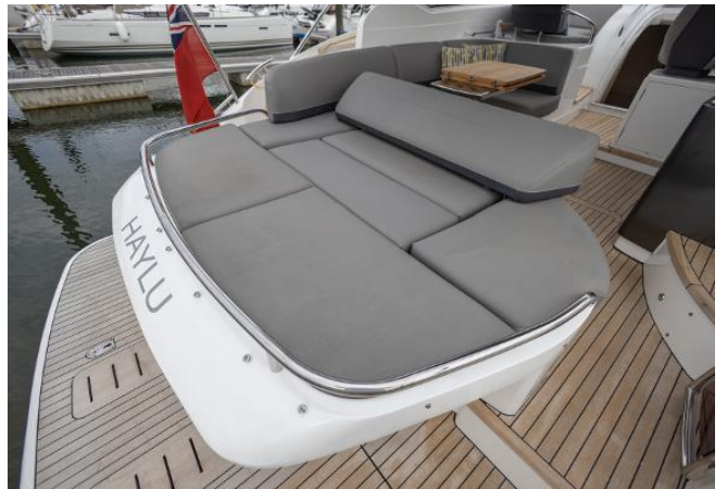
Princess V39 For Sale