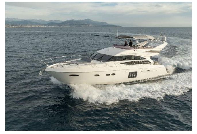
Princess 64 Flybridge For Sale