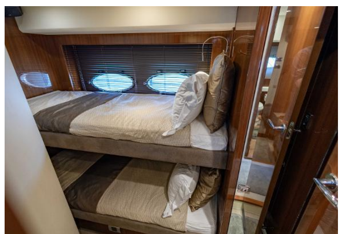
Princess 64 Flybridge For Sale