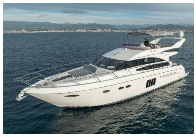
Princess 64 Flybridge For Sale