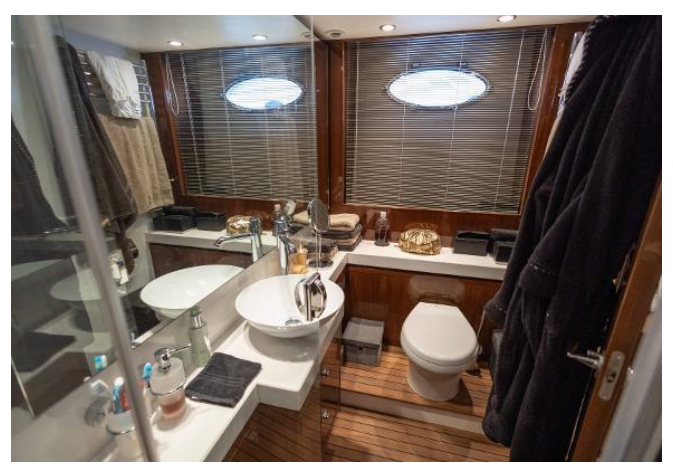
Princess 64 Flybridge For Sale