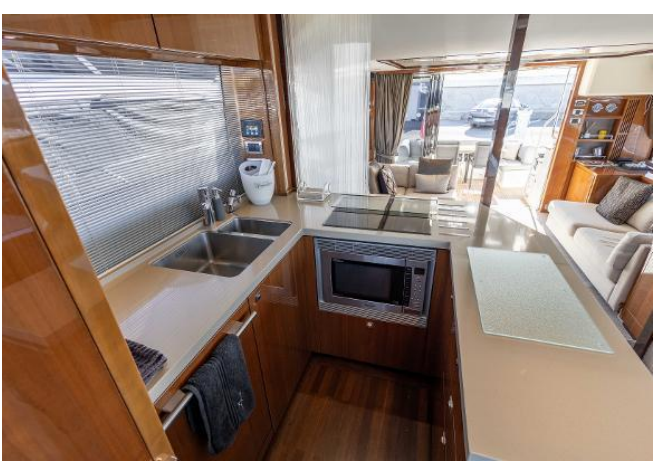
Princess 64 Flybridge For Sale