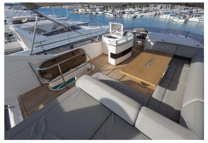
Princess 64 Flybridge For Sale