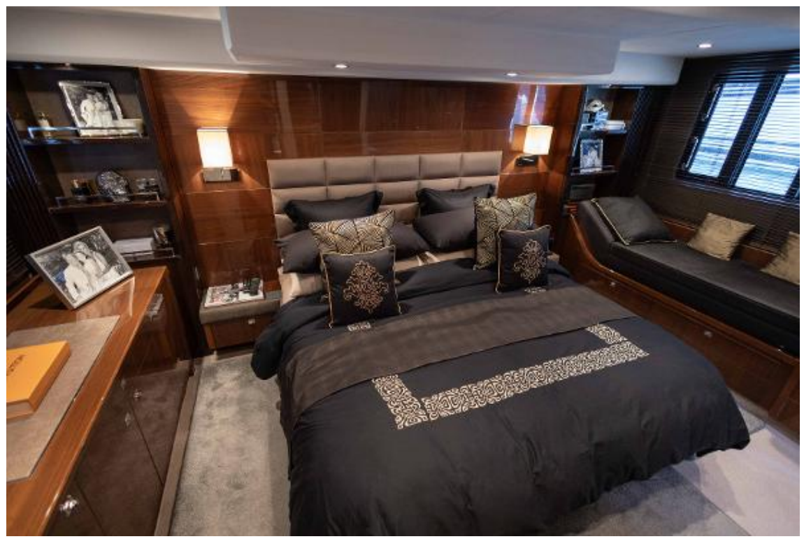
Princess 64 Flybridge For Sale

Email: ukbrokerage@princess.co.uk Tel: +44 (0)1489 557755