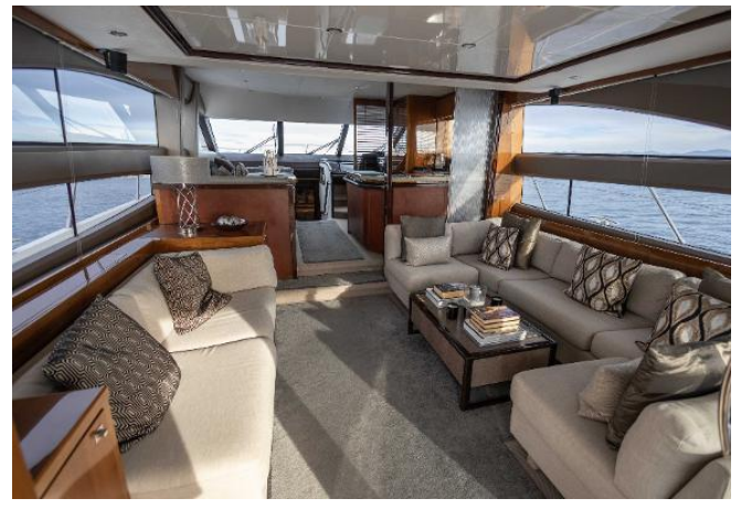
Princess 64 Flybridge For Sale