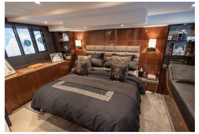
Princess 64 Flybridge For Sale