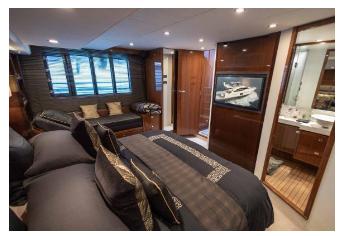
Princess 64 Flybridge For Sale