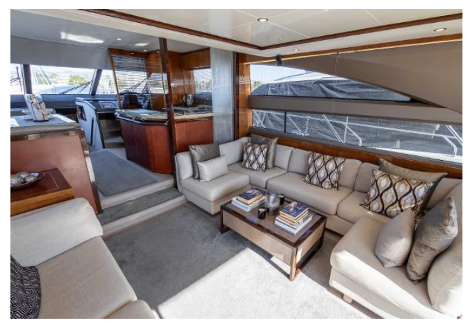
Princess 64 Flybridge For Sale