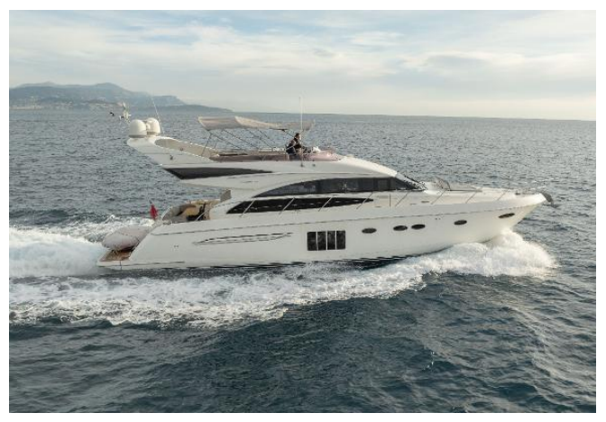
Princess 64 Flybridge For Sale