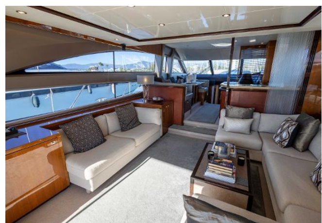
Princess 64 Flybridge For Sale