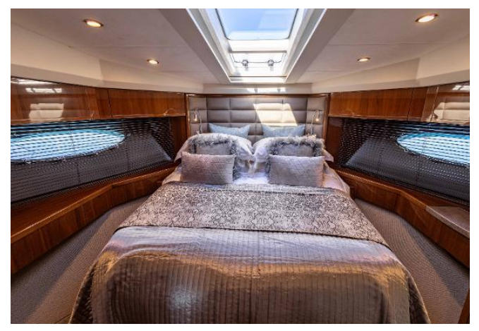
Princess 64 Flybridge For Sale