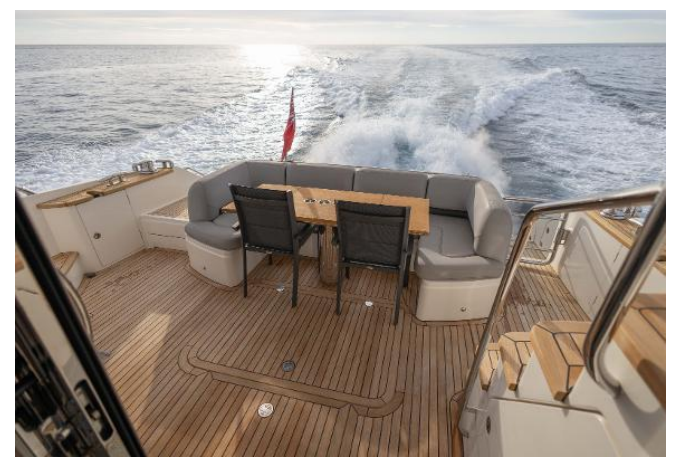
Princess 64 Flybridge For Sale