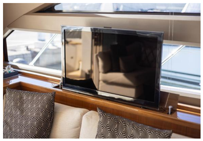
Princess 64 Flybridge For Sale