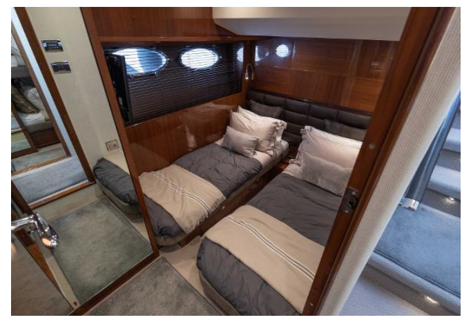
Princess 64 Flybridge For Sale