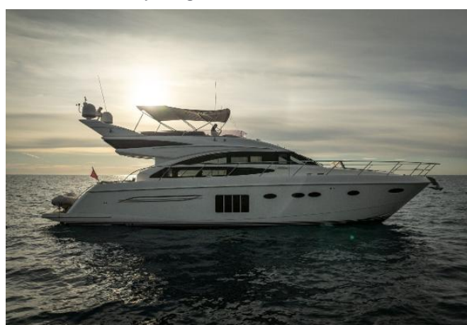
Princess 64 Flybridge For Sale