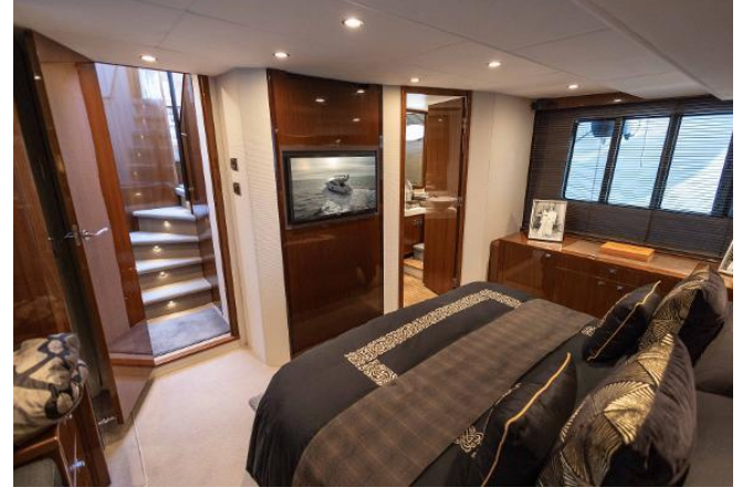
Princess 64 Flybridge For Sale