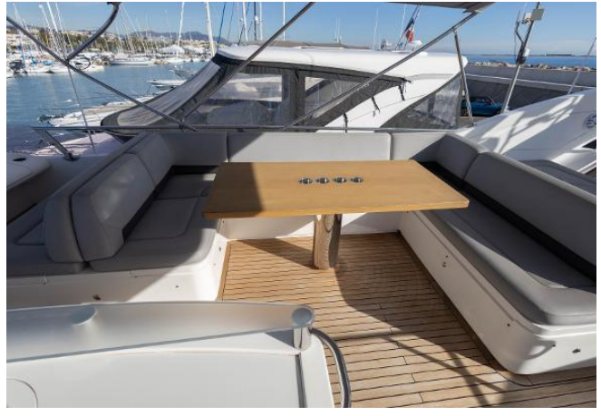
Princess 64 Flybridge For Sale