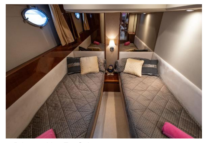
Princess V56 For Sale