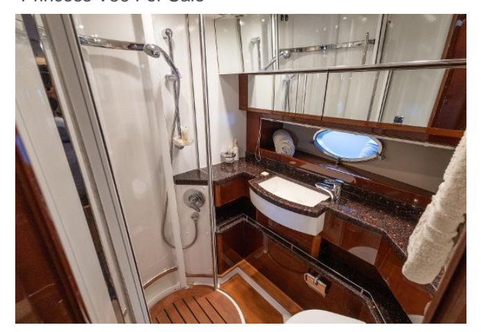
Princess V56 For Sale