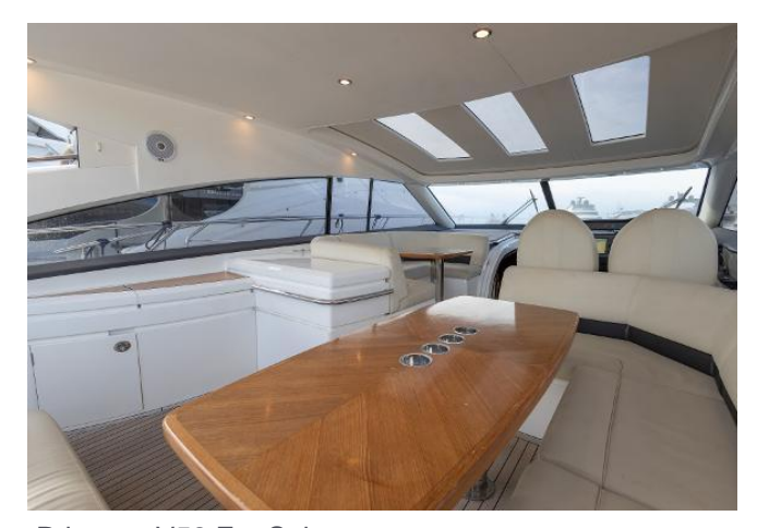
Princess V56 For Sale