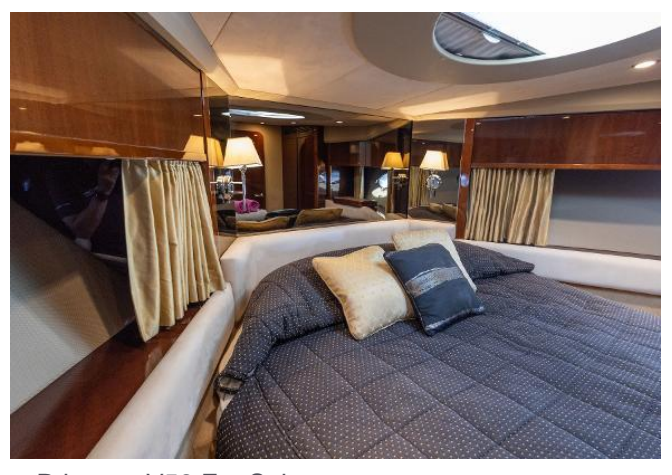
Princess V56 For Sale