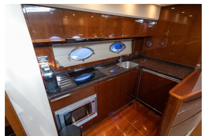
Princess V56 For Sale