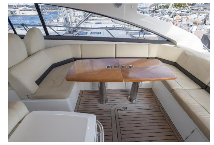
Princess V56 For Sale