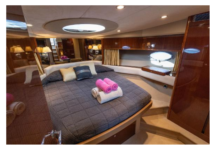
Princess V56 For Sale