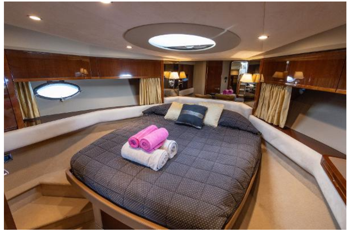
Princess V56 For Sale