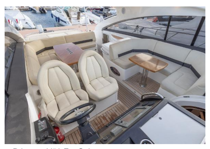
Princess V56 For Sale