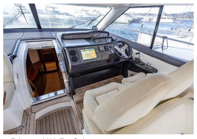
Princess V56 For Sale