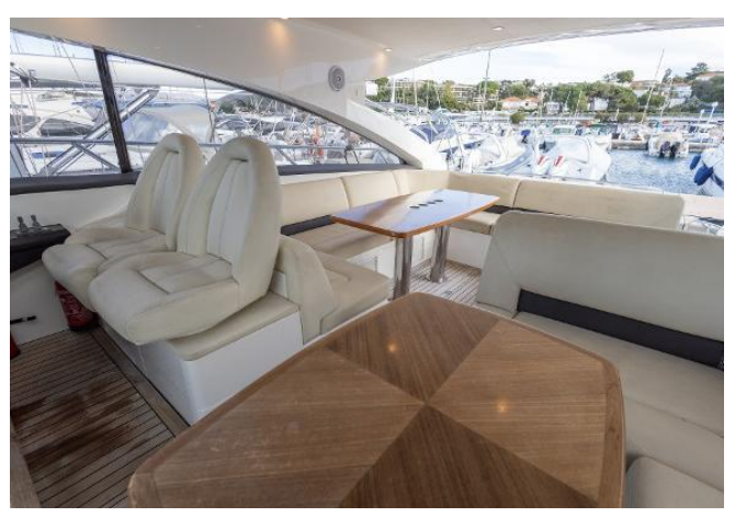
Princess V56 For Sale