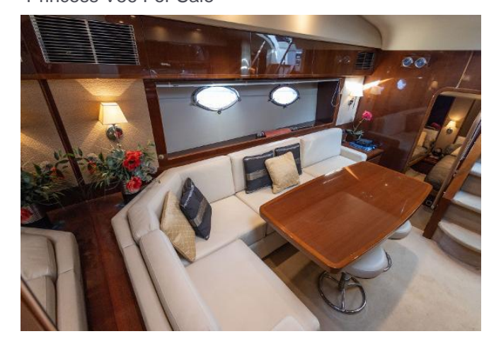
Princess V56 For Sale