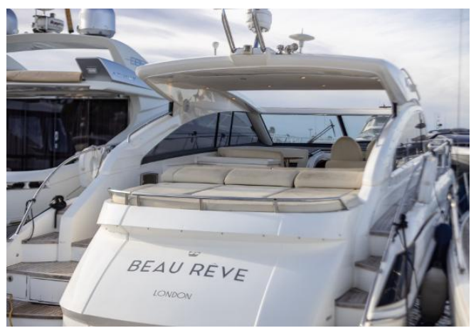
Princess V56 For Sale