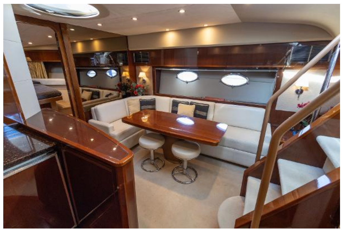
Princess V56 For Sale