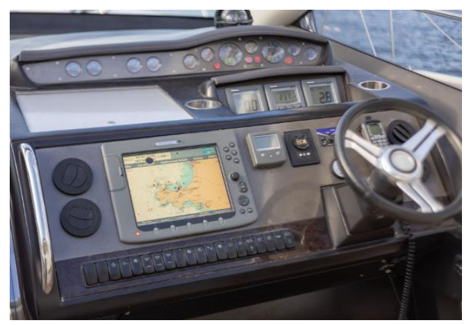
Princess V56 For Sale