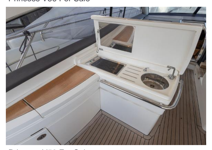
Princess V56 For Sale