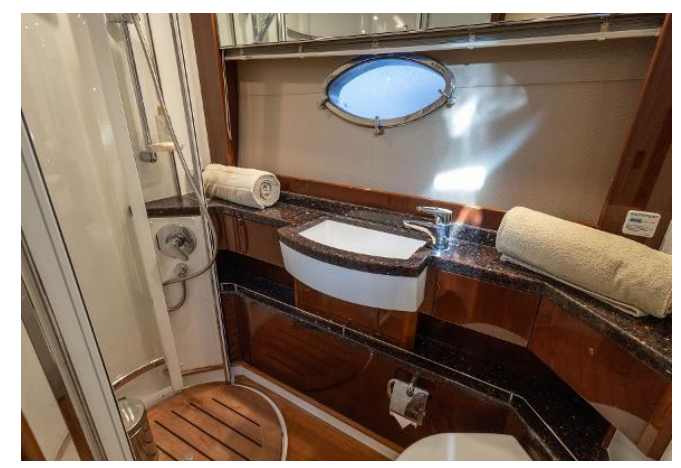
Princess V56 For Sale