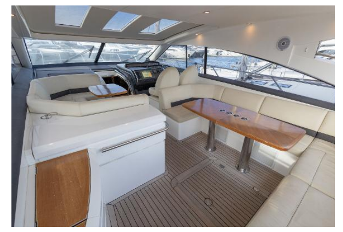
Princess V56 For Sale