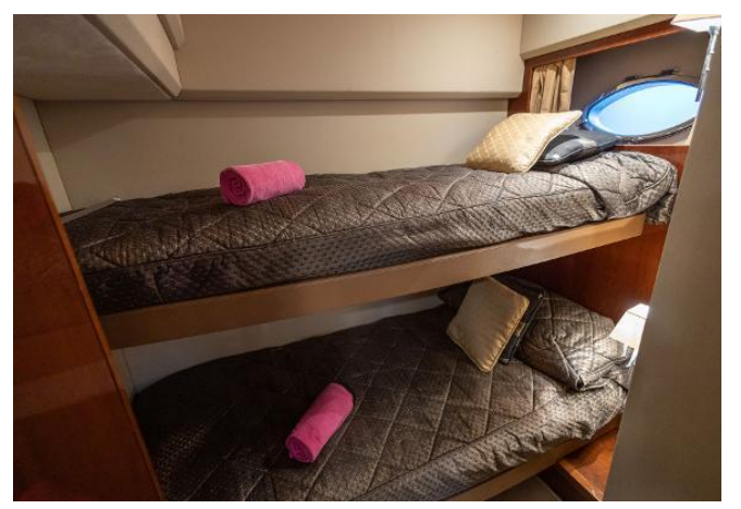
Princess V56 For Sale