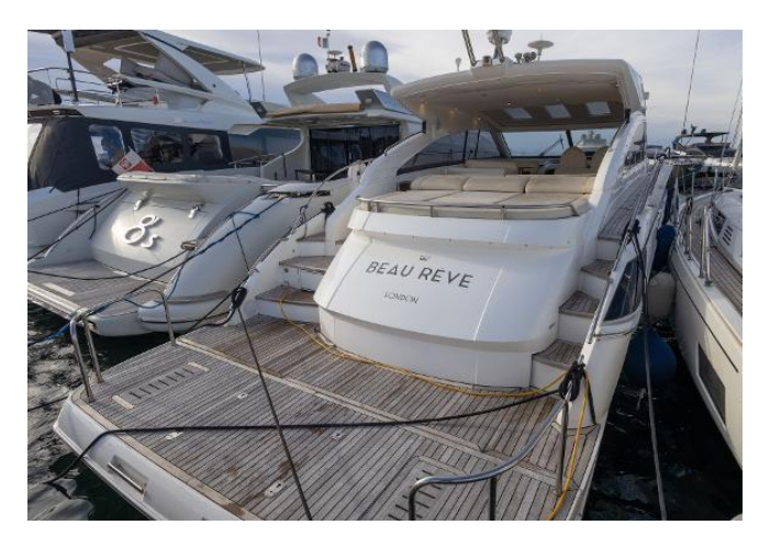
Princess V56 For Sale