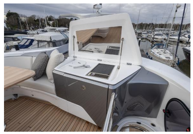
Princess S65 - Available Now