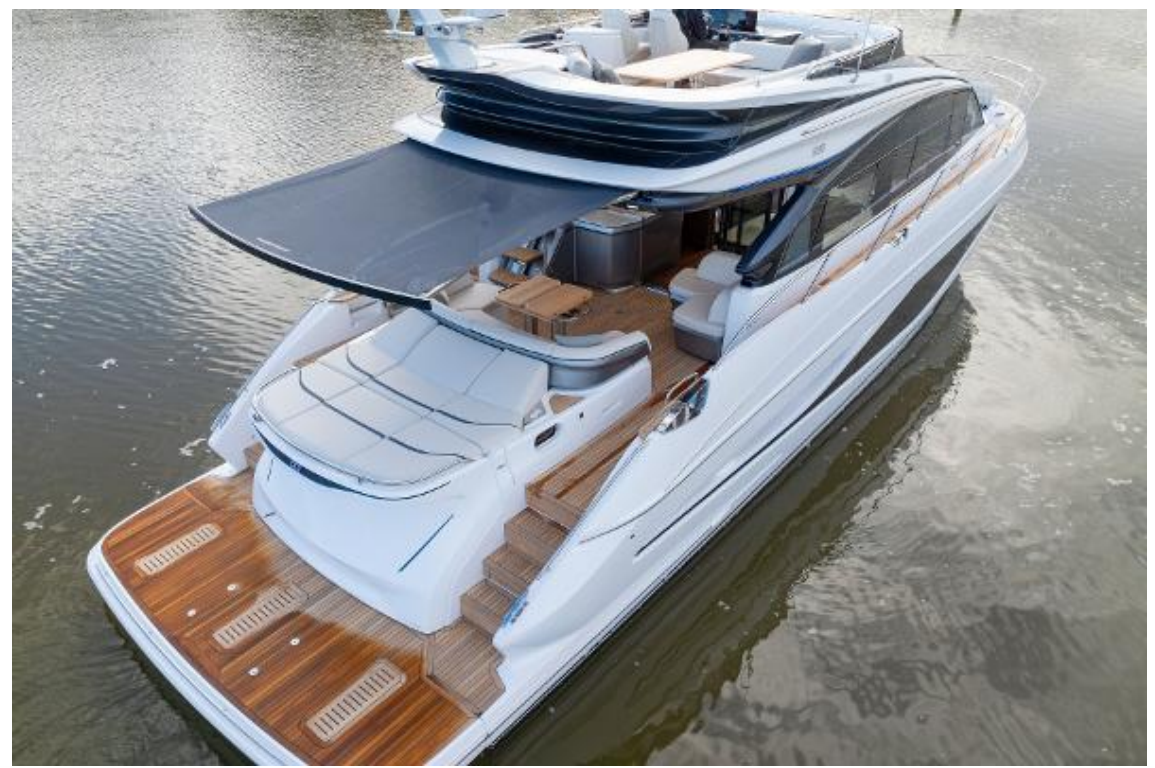
Princess S65 - Available Now