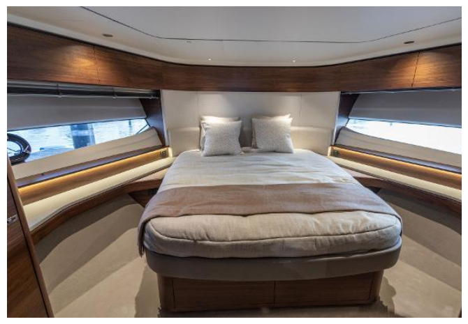
Princess S65 - Available Now