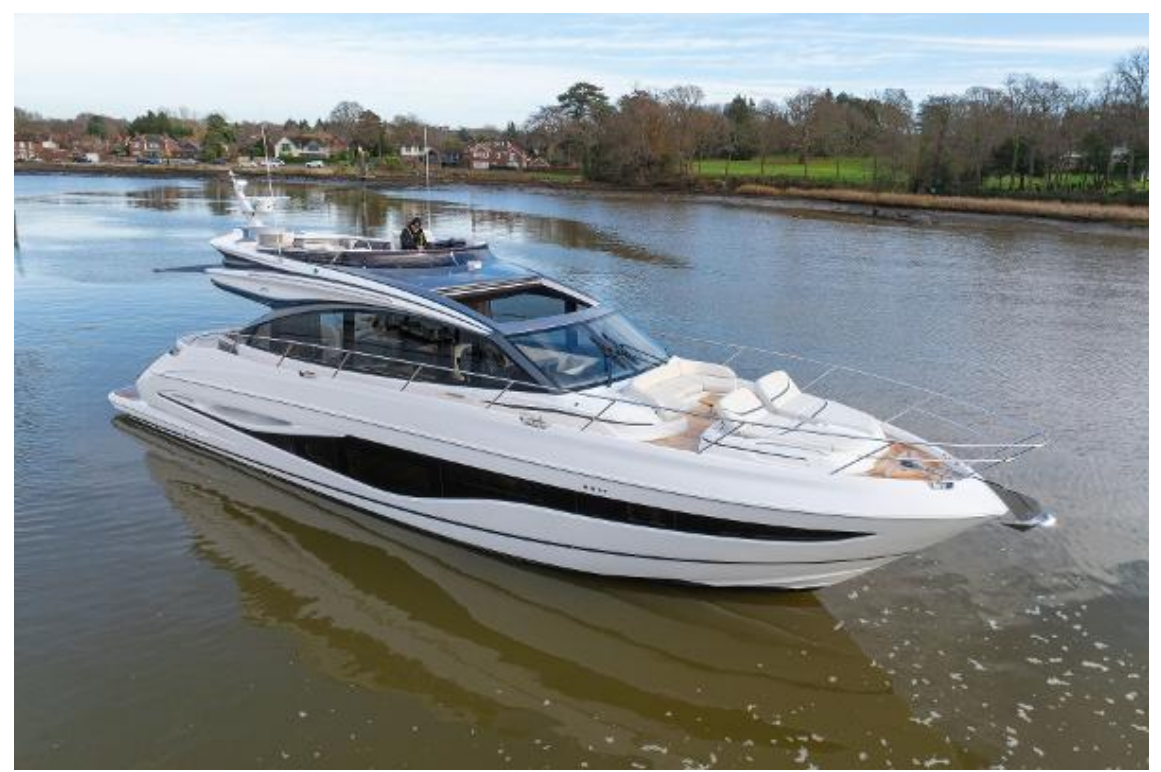
Princess S65 - Available Now