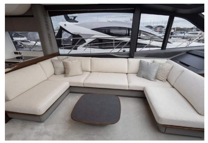
Princess S65 - Available Now