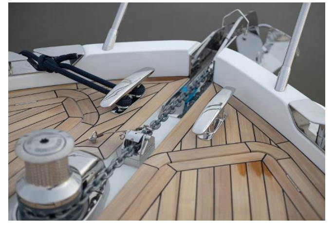
Princess S65 - Available Now