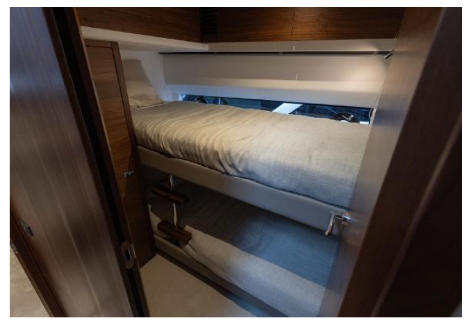
Princess S65 - Available Now