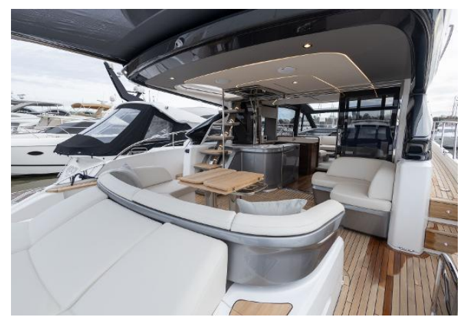
Princess S65 - Available Now