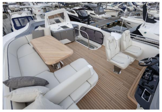
Princess S65 - Available Now