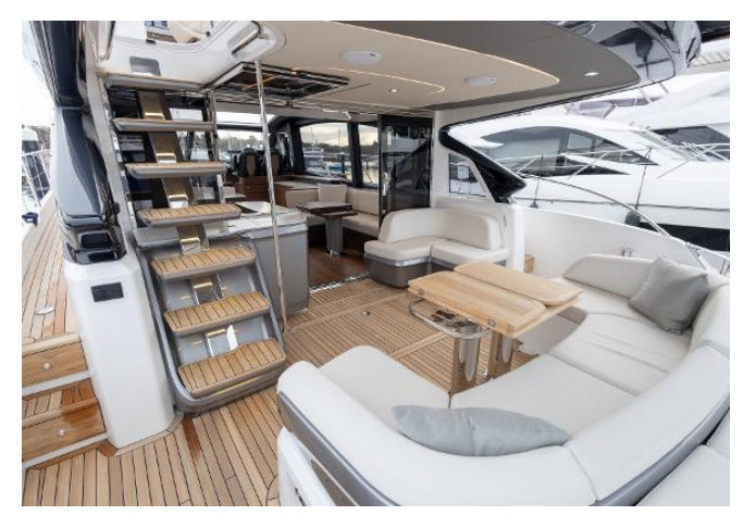
Princess S65 - Available Now