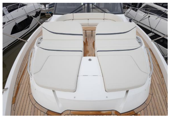
Princess S65 - Available Now