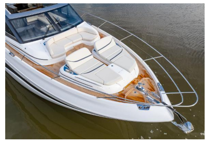
Princess S65 - Available Now