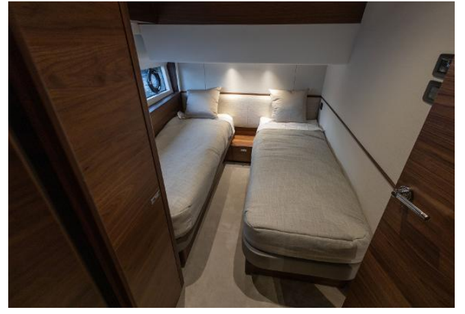
Princess S65 - Available Now