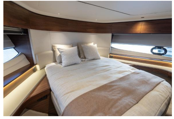
Princess S65 - Available Now