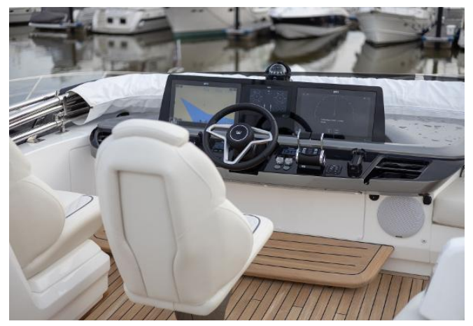
Princess S65 - Available Now