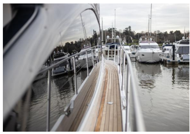
Princess S65 - Available Now