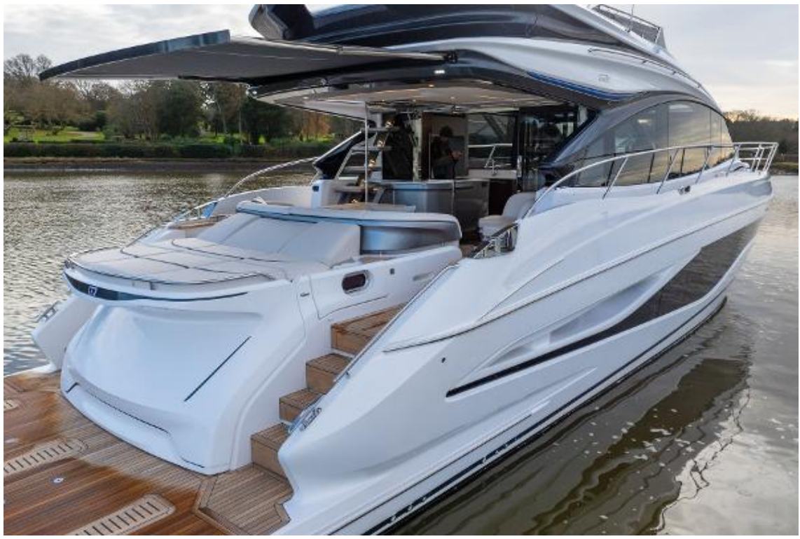
Princess S65 - Available Now

Email: sales@princess.co.uk Tel: 01489 557755