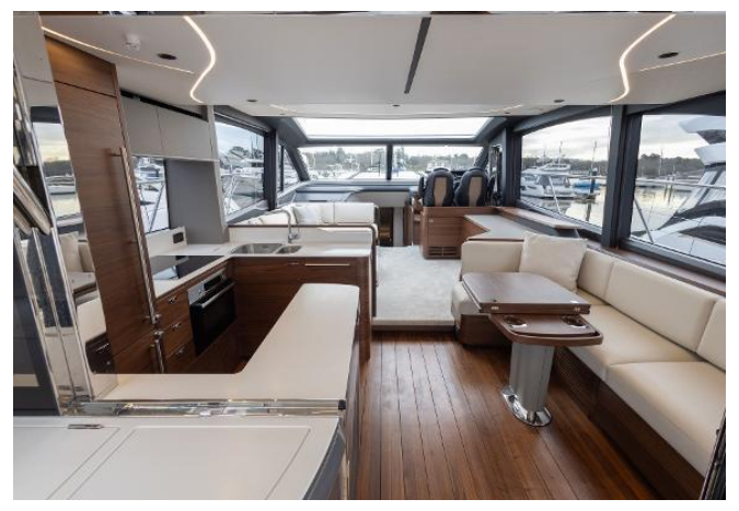
Princess S65 - Available Now