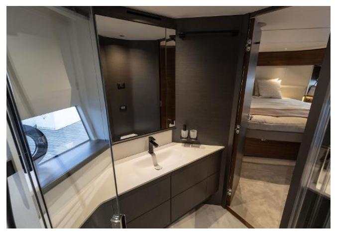
Princess S65 - Available Now