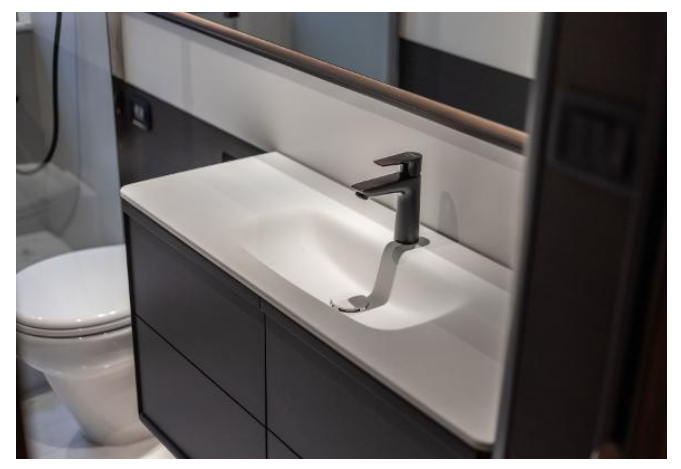
Princess S65 - Available Now